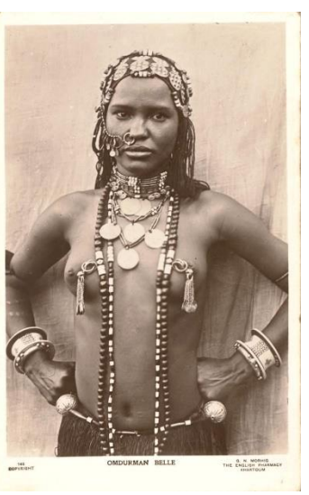
Figure 4: A) Photograph of two Egyptian women, hand captioned 'Egyptian Belles' in imitation of a postcard. B) Commercial postcard showing a semi-clad Nubian woman captioned 'Omdurman Belle'. Perhaps an ethnographic equivalent of the French postcard.