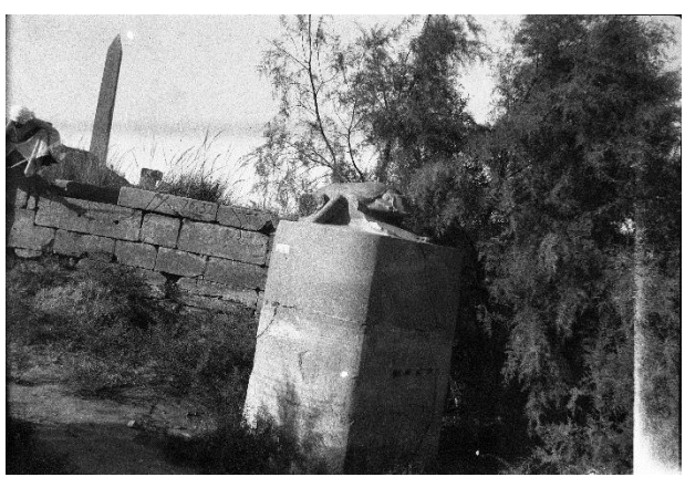
Figure 8: The stone scarab at Karnak then playing a less prominent tourist role that it has done in more recent times. From the collection of Lieutenant Sergeant Johnson, item accession number 1593, The Egypt Centre, Swansea University.