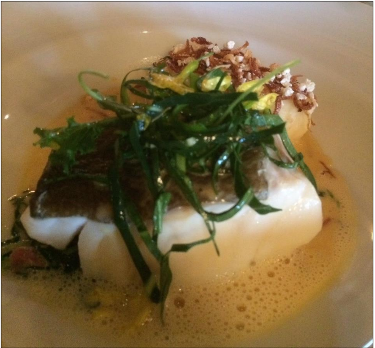
Figure 2: Gene-edited cabbage was on the menu at the conference dinner (from @GARNetweets)