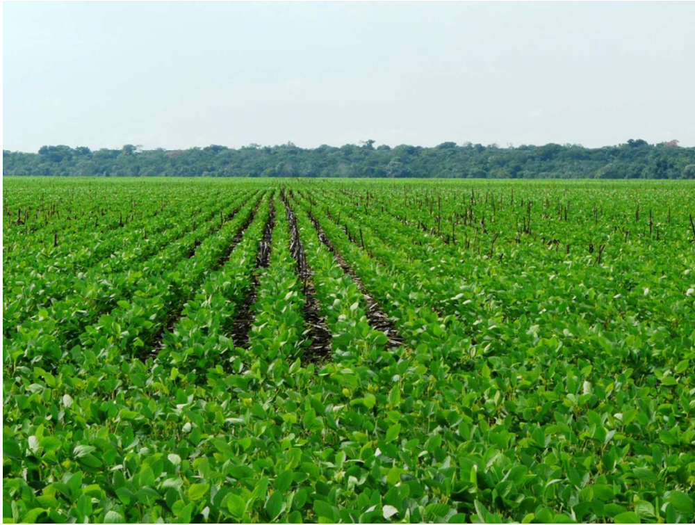
127x95mm (220 x 220 DPI)