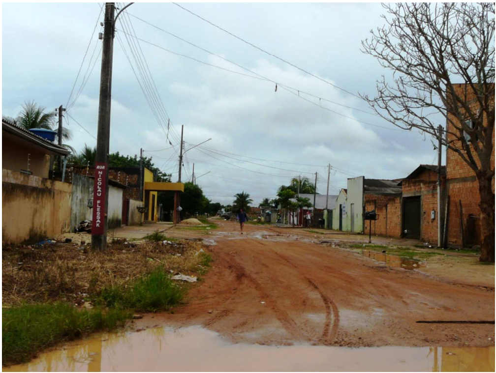
126x94mm (220 x 220 DPI)