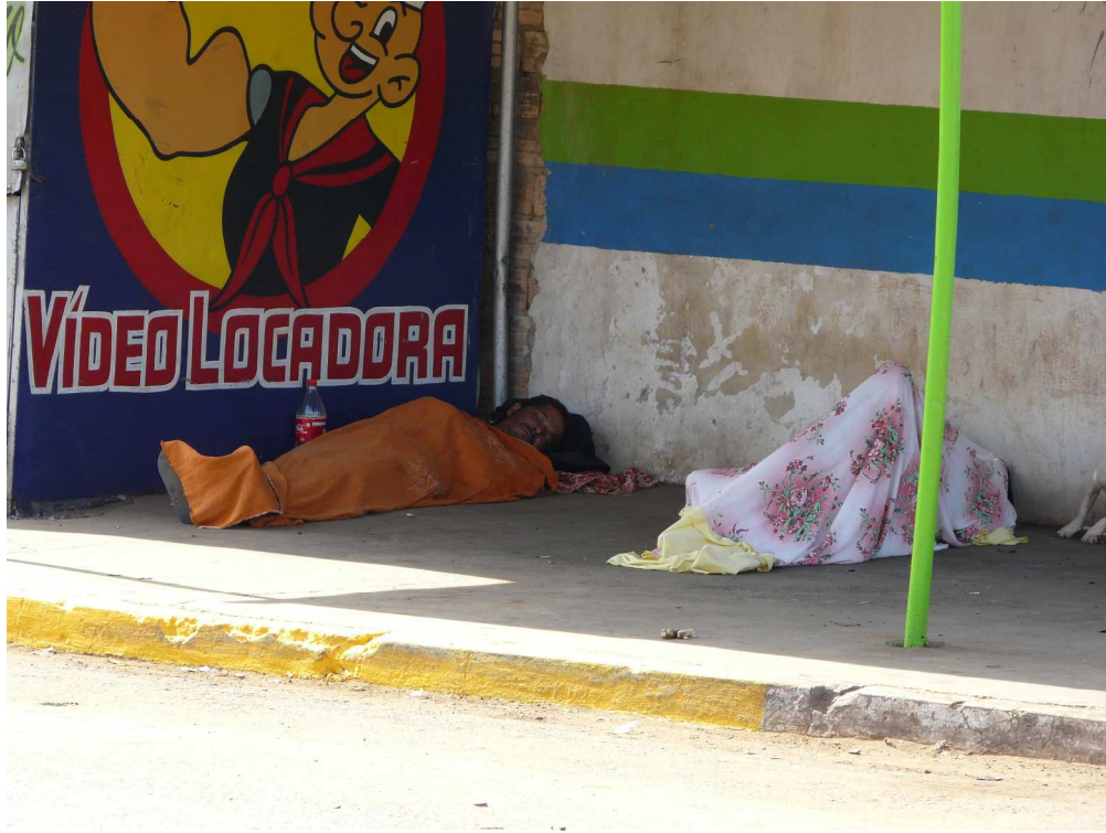
1151x863mm (72 x 72 DPI)