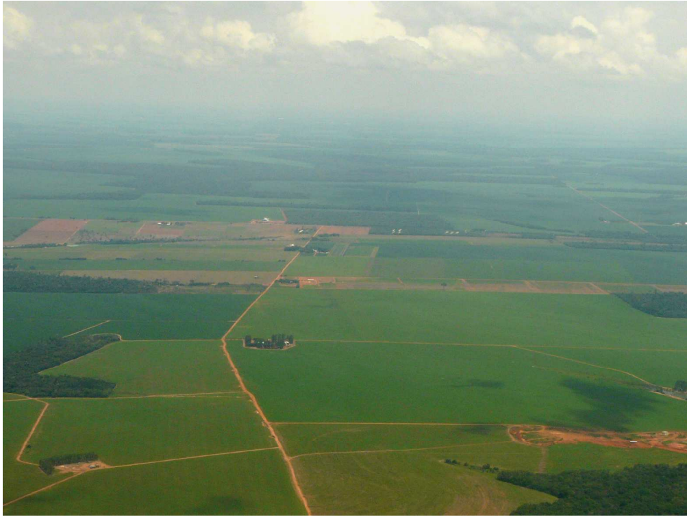
903x677mm (72 x 72 DPI)