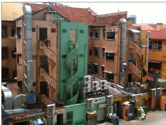
Figure 1: Backstreet shop houses, Singapore

Yet, this strictly regimented city-state tolerates prostitution. Formerly a triad run criminal activity, regulated prostitution operates under the auspices of the state. Doctors who are undergoing compulsory National Service have the unsavoury task of testing sex workers for sexually transmitted diseases. Yellow tags worn around the neck are issued monthly to sex workers who pass the medical. In Singapore, the legal/state apparatus of capture jealously guards all permissions and prohibitions, yet turns a pragmatic blind eye to prostitution, a sex-capitalist apparatus of capture. Sex workers are captive to pimps, ensnared in debt, medical bills, and drug habits (their own or significant others'). For the punters, or 'Johns', the economic pursuit of carnal pleasure violates the possibility of genuine loving relationships. Meanwhile, 'promoters' (pimps) are captive to the triads, and all are captive to the state, through taxation, medical screening obligations, and licensing.