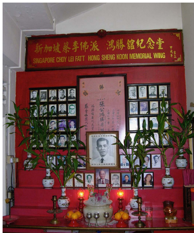
Figure 3: Hung Sing memorial deathscape, Singapore, 2007