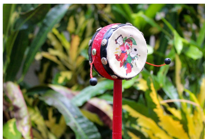
Figure 4: Hand-held drum-shaped rattle (bōlànggǔ)