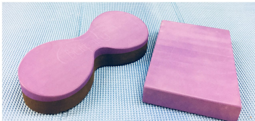
Figure 1. (a) Inclined wedge (Buttafly™) (b) Standard sitting block (30 × 20 × 5 cm).

Subjects were given standardized verbal and visual instructions to “sit centrally on the wedge/ Butterfly™/mat, cross your legs, bring your heels as close to you as possible, rest your hands on your knees and sit comfortably”. In each sitting condition 3 consecutive photographs were captured at 2 min into each sitting position. The 2-minute task duration was selected to resemble Yoga and Pilates practice within which the postures (pose) is held typically for 30 to 60 s and not exceeding 2 min (Cramer et al., 2013; Holtzman & Beggs, 2013), thus deemed an appropriate postural