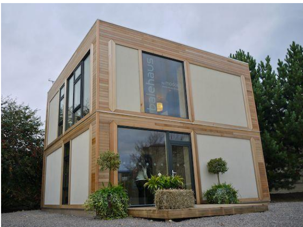
Figure 3 Modcell’s Balehaus@Bath 8

This company was deliberately system building, translating ‘deep green’ materials to the mainstream, but at the same time accommodating modern building practices of low-skill requirements, easy and quick construction and modern aesthetics, as well as consumer expectations about housing appearance. Thus niche practices can be translated to the mainstream, albeit incorporating significant modifications. Figures 2 and 3 illustrate the diversity of straw bale building styles which can arise from the same basic technology.