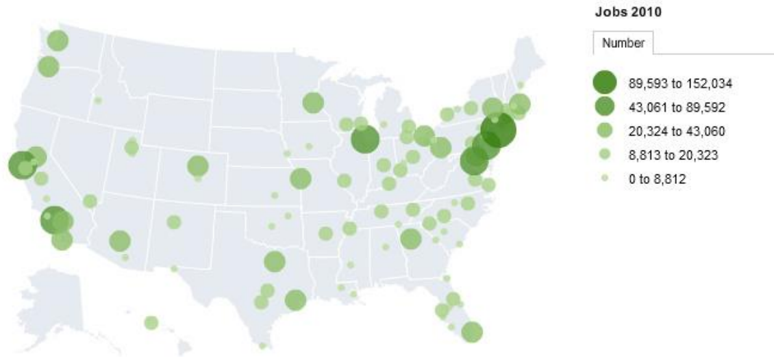
Figure 1. Aggregate Clean Economy by Metropolitan Area by Job Numbers.