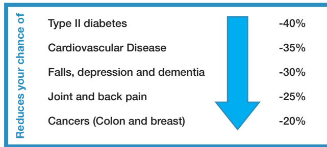
Figure 2: Physical Activity Benefits for Adults and Older Adults, UK Chief Medical Officers' Guidelines 2011

The mental and physical benefits of physical exercise are well known. As well as improving sleep, managing stress and improving quality of life, a Department of Health infographic (Figure 2), details the following benefits of physical activity for adults.