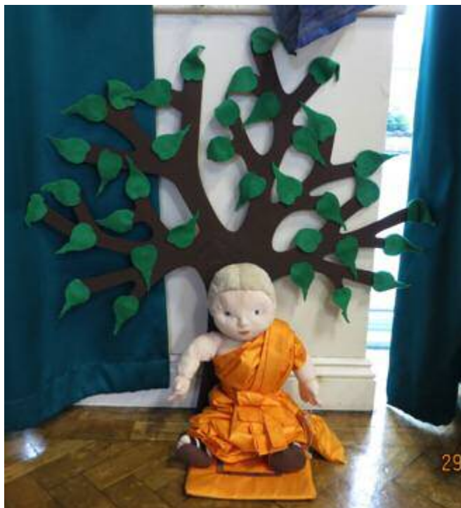
Buddha under Bodhi tree