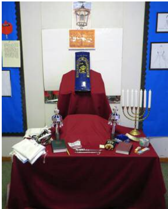
Synagogue in a school