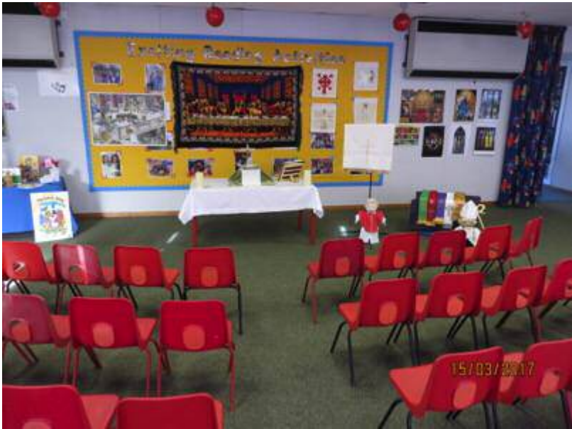
Church in a school