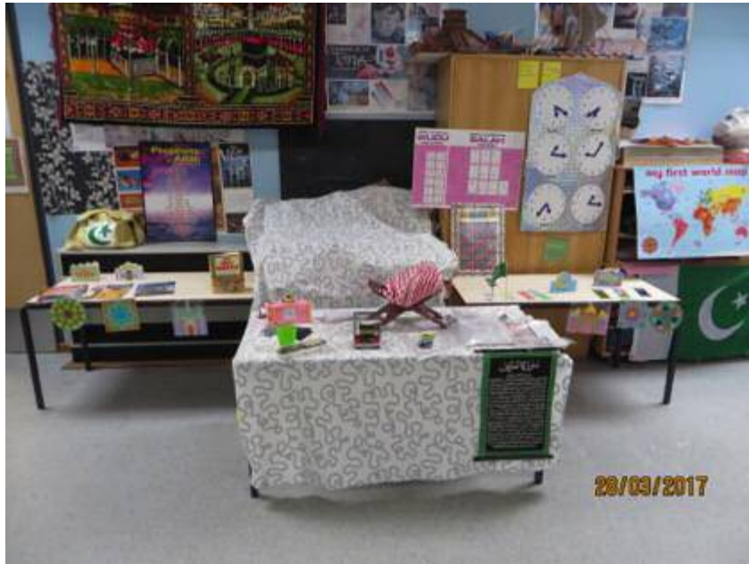
Mosque in a School