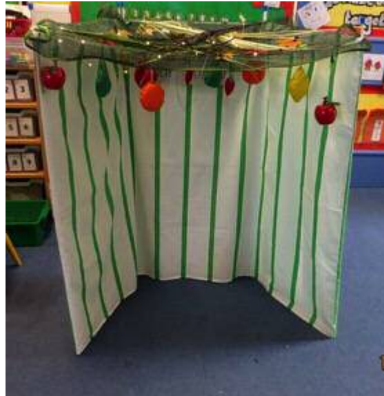
Jewish festival of Succot