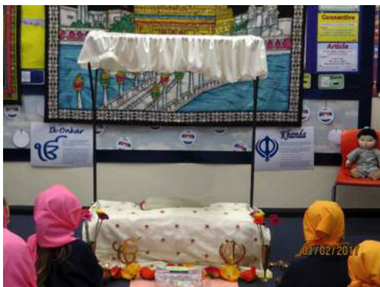
Gurdwara set in a school