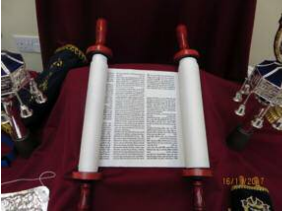
Jewish Torah scroll