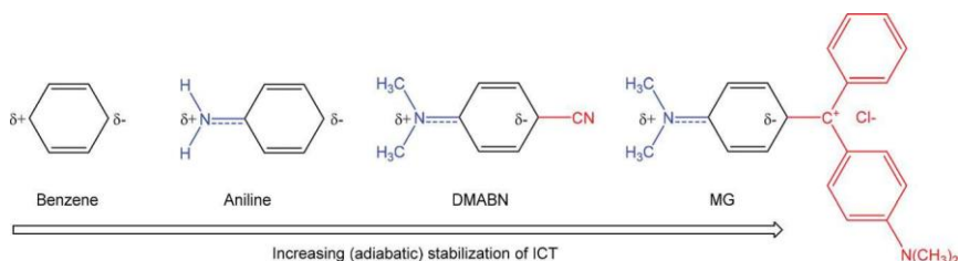
Fig. 2 Scheme showing the zwitterionic ICT valence bonding structure of benzene's 2^1pp^* ( 1^1B_{1u} ) state in the vertical Franck–Condon region and how the character of this state can be stabilized/manipulated through the addition of electron 'donor' and 'acceptor' groups.

to the N(CH_3)_2 moiety can lead to the stabilization of ICT in the 2^1pp^* manifold through the twisting of the N(CH_3)_2 group relative to the phenyl ring, causing DMABN's classic dual-colour uorescence. 3 Yet further 'tuning' of this ICT can be seen in the more complex malachite green (MG) system, where a carbocation centre lying para to the N(CH_3)_2 group leads to dramatic ICT stabilization, effectively deactivating the uorescence and opening the rapid internal conversion to S_0 through conical intersections. 4,5 This seemingly inherent ICT character of the 2^1pp^* state does not have its origins in the aniline motif, but actually originates from the more fundamental benzene chromophore, whose 2^1pp^* ( 1^1B_{1u} ) state exhibits the same zwitterionic ICT valence bonding structure in the vFC region (see Fig. 2). 6