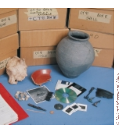
△ Archaeological archive.

The survey took the form of a questionnaire that was distributed to 133 organisations of which 95 replied, giving a response rate of 71%.