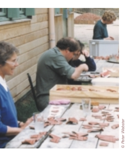
△ Experts and Lifelong Learners study samian ware.

The varied nature of archaeology involving field work, scientific examination and interpretation makes this problem acute, but it is not an issue that is unique to archaeology. Strategies for digital preservation, the management of grey literature and copyright of transferred materials will have relevance for a much wider user base.