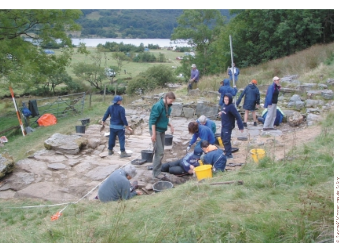
△ Gwynedd and Môn Young Archaeologists' Club dig at Nant Gwynant. Finds deposited at Gwynedd Museum and Art Gallery, Bangor.