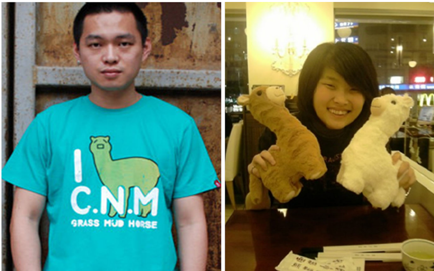
Figure 7 Caonima T-shirt and toys ( http://www.gxyin.com/ShowNews.aspx?id=569 )