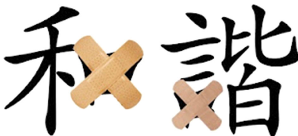
Figure 3 Hexie with no ‘mouth’ ( http://webfee.blogspot.com/2011/10/blog-post_30.html )

The parody of ‘harmony’ has, ironically, turned the word itself into a so-called sensitive word, an object of policing. When the word hexie begot censored and ‘harmonized’ online, netizens adopted a new word, ‘river crab’ (河蟹), to replace