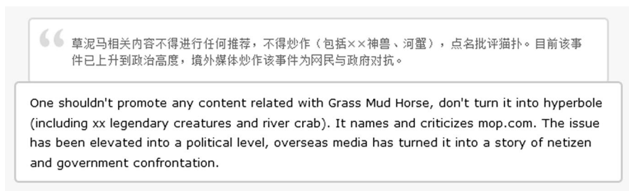
Figure 9 “One shouldn’t promote any content related with grass mud horse” ( http://globalvoicesonline.org/2009/03/18/china-goodbye-grass-mud-horse/ )

Policing seems omnipresent, but so do phenomena of hexie and caonima . The banality of power (Mbembe 1992) in the name of harmony already presupposes the existence of disharmony. The question to ask, then, is ‘not whether the Internet will democratize China, but rather in what ways the Internet is democratizing (or will democratize) communication in China’ (Tai 2006:184).