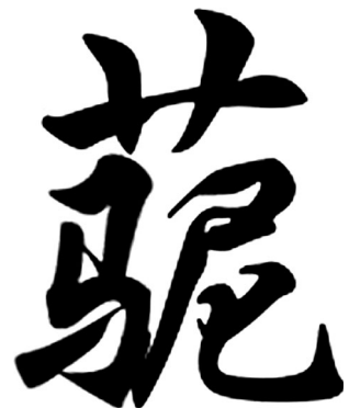
Figure 5 ‘Grass mud horse’: a new Chinese character ( http://shanghaiist.com/2009/03/23/character_of_the_day.php )

One such example is an online video called ‘the song of caonima ’ which went viral after its release in 2009. The song (again with a few versions) features a digital