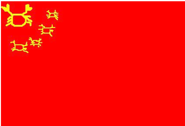
Figure 4 River crab on the national flag

To illustrate this point, we turn to another well-known Internet phenomenon since 2009: a ‘modern myth’ (Hopkins 2011) about ‘river crab’ fighting ‘grass mud horse’—another Internet meme created by netizens. ‘Grass-mud horse’ comes from cǎonímǎ 草泥马, a seemingly innocent nonsense word. However, it is a carefully invented homophone (again with different tones) of another harmonizable expression, càonīmā 禽你妈, which means ‘fuck your mother’. Although the Chinese censorship system aims to curb obscene use of language, the pun effect of caonima enables netizens to transgress while satirizing the policy with impunity. This eventually makes the word an icon of grassroots aspirations for freedom of speech. Netizens even designed a written form for this three-character-phrase, by combining elements of each of the three characters 草, 泥 and 马 (see Figure 5). As a netizen named Kenneth Tan explains, ‘The 艹 radical refers to ‘grass’ (草), 尼 resembles 泥 and both are homophones, while 马 is the character for ‘horse’. The new character even has a recommended pronunciation jiànyú ’.