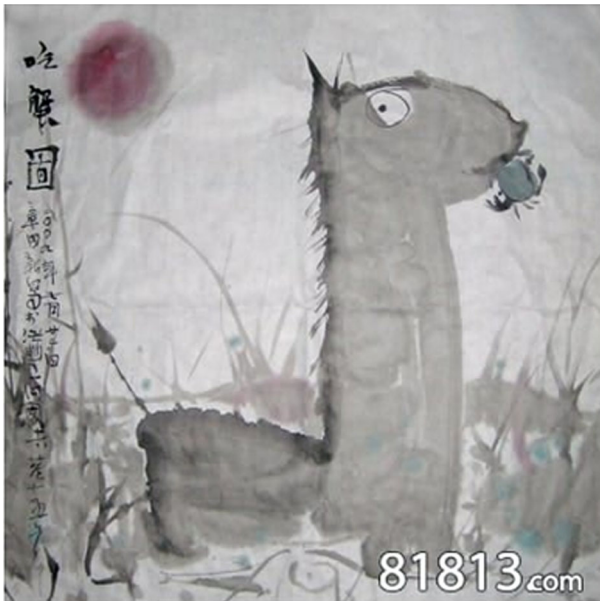
Figure 6 ‘Grass mud horse’ swallowing ‘river crab’ ( http://kahnlei.blog.sohu.com/147096077.html )

voice of a children’s chorus singing about the life of the grass mud horse in the theme tune of the famous cartoon series The Smurfs , as if to highlight the cuddly creature’s decency, innocence, and vitality. In one of the versions published on YouTube ( http://www.youtube.com/watch?v=wxk1aenjk08 ), the song lyrics are subtitled in English as follows: