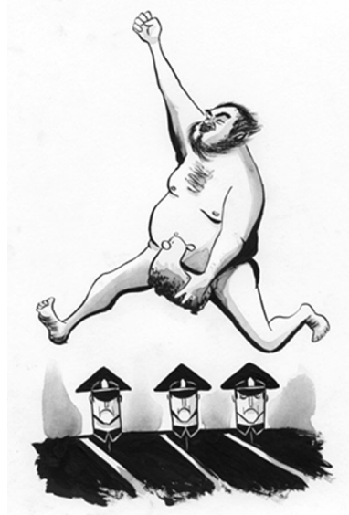
Figure 8 Ai Weiwei with caonima ( http://www.tomtian.com/#s=2&mi=2&pt=1&pi=10000&p=4&a=0&at=0 )