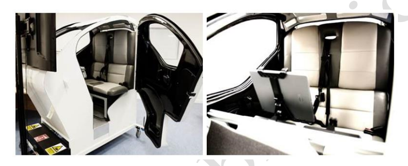
Fig 2. Exterior (left) and interior (right) of Lutz Pod simulator

Twelve journeys were filmed, mainly on public roads in and around Bristol (UK) city during the summer. Each route was planned using Google Maps and a route planner, and included a 2-minute pre-planned stop. Two journey types were recorded: short (7-minutes including stop) and long (12-minutes including stop). Four were selected (two short, two long) which gave a good representation of driving within inner and outer urban Bristol settings, with a mixture of road types, speed limits ranging from 20-40-mph, a blend of road infrastructure (e.g., traffic lights, crossings, roundabouts), and varied scenes (highly built-up to outer city suburbs with green spaces). An example journey was travelling from a railway station to home via a medical center.