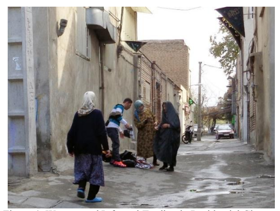
Figure 4: Women and Informal Trading in Residential Clusters