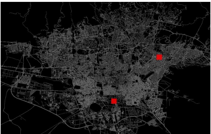
Figure 1: Location of the Study Areas in the City of Tehran