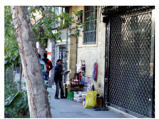
Figure 7: Stationary activities are often limited to informal trading along the east-west street.

The existing urban morphology of this site area is a result of a standardised layout that includes a number of neighbourhood parks surrounded by some residential clusters. As observations and visual recordings show, patterns of gender mix are relatively different in the main streets, residential clusters, and neighbourhood parks. As illustrated in the Figure 5, most of the residential clusters accommodate a mix of different groups distributed unevenly across the site area. Exceptions to this pattern are neighbourhood parks with designed seats and some sport furniture surrounded by residential buildings. Some of these local parks, specifically the ones adjacent to the work and visit areas, are temporarily appropriated by different user groups. Observations show that every morning from 6am to 9am, some male and female users are attracted to the parks to do sports, while during the midday peak these open spaces are often appropriated by the elderly meeting their peers or school children playing while their parents are talking to each other. In the evening, young groups are the dominant users of the space.