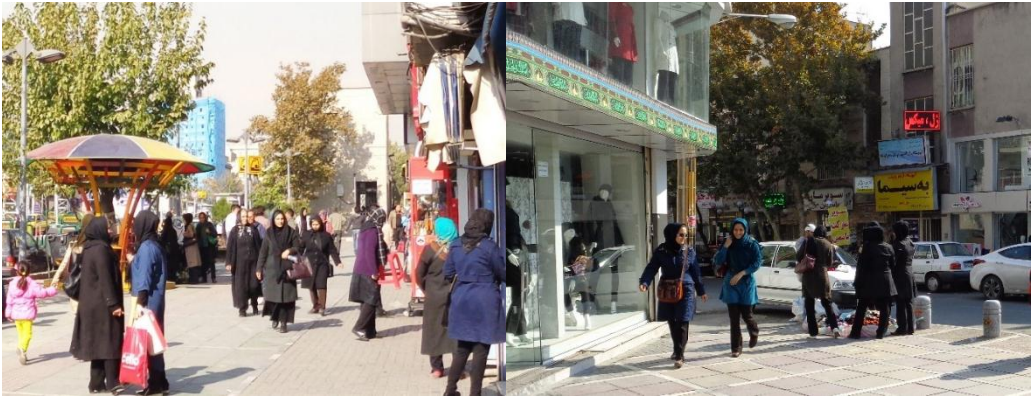
Figure 6: Presence of Women along the Main Shopping Street of Sarsabz

While the study area of Sarsabz benefits from a mix of different gender groups with a relative dominance of female users along the main north-south shopping strip, it does not accommodate a range of different activities along its main east-west street, which is predominantly an area of office buildings with low levels of pedestrian flows and high levels of through vehicular traffic. Figure 5 shows a relative dominance of the male users along this street to the west. During the working hours, motorcycles are usually parked along the sidewalks. Some visitors use the motorcycles as a place to sit and talk to the nearby people. Figure 7 shows sidewalks of this street where the stationary public actions are limited to a few street vendors who are mostly men.