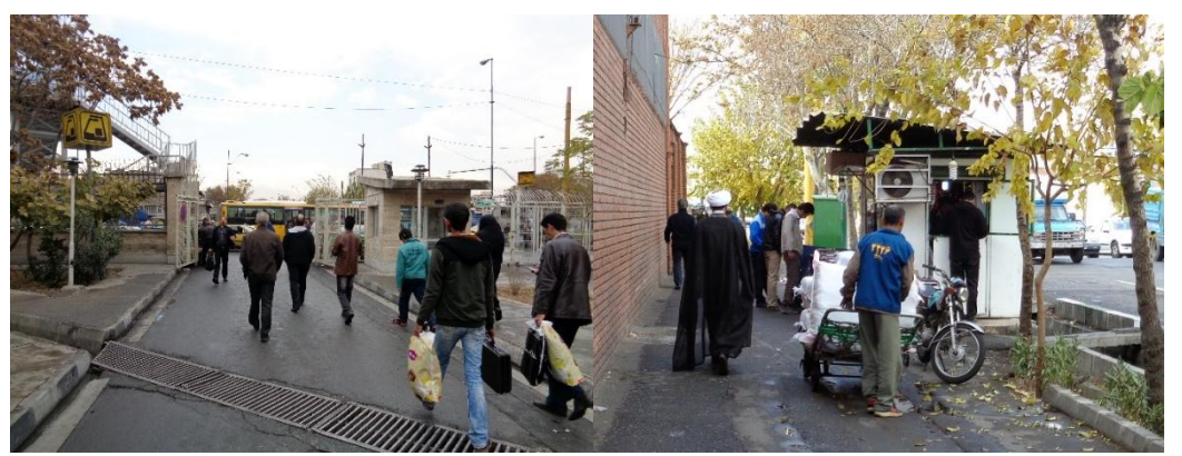
Figure 3: The study area of Shoosh is generally male-dominated.