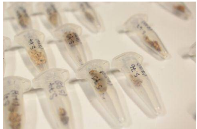
Figure 1. Fragmentary cetacean bone being prepared for ZooMS analysis.

Research on the archaeological remains of cetaceans is fraught with difficulties surrounding morphological identification. Whilst biological texts for identifying live, recently dead, or complete cetacean skeletons exist, there is little international expert knowledge available for dealing with fragmented archaeological assemblages. Species identifications are possible for the majority of bones in the cetacean body. Teeth, tympanic bones, and skulls in particular are well suited to species identification and have been used successfully in archaeological studies (e.g., Glassow 2005). Others, including the vertebrae, can also be reliably identified to family and in most cases species. However, while some studies have had success in identifying cetacean bone using morphological methods, others have proved to be inaccurate, and have in some cases led to incorrect identifications (e.g., Cumbaa 1986). These inaccuracies are coming to light in the face of modern techniques of analysis such as DNA and ZooMS (Zooarchaeology by Mass Spectrometry).