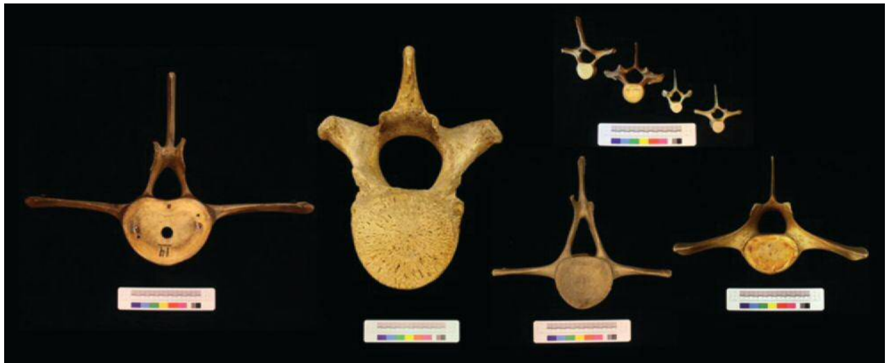
Figure 2. Comparative image showing thoracic vertebrae from left to right, large species: Sei whale, Sperm whale, Orca, Minke whale; and from left to right, small species: Atlantic white-sided dolphin, White-beaked dolphin, Harbor porpoise, and Common dolphin.

We are collecting measurements of the centrum width (CW) and centrum height (CH), front and back, as well as the centrum length (CL), overall height from the base of the keel to the top of the neural process (H), the greatest width of the transverse processes (GLPT), and the breadth of the neural arch (BNA) at its widest point (see Figure 3). We are also collecting images with a scale, showing the bones recorded, along with notes relating in particular to the shape of the centrum, inclination of processes, strength or exaggeration of the keel, and presence, number, and location of foramen. On vertebrae these include foramen present along the dorsal side of the vertebra in the neural arch area, or along the sides of the vertebra, or its ventral aspect. Where full specimens are present, we hope to collect data relating to every other vertebra along the spine in order to build a robust dataset.