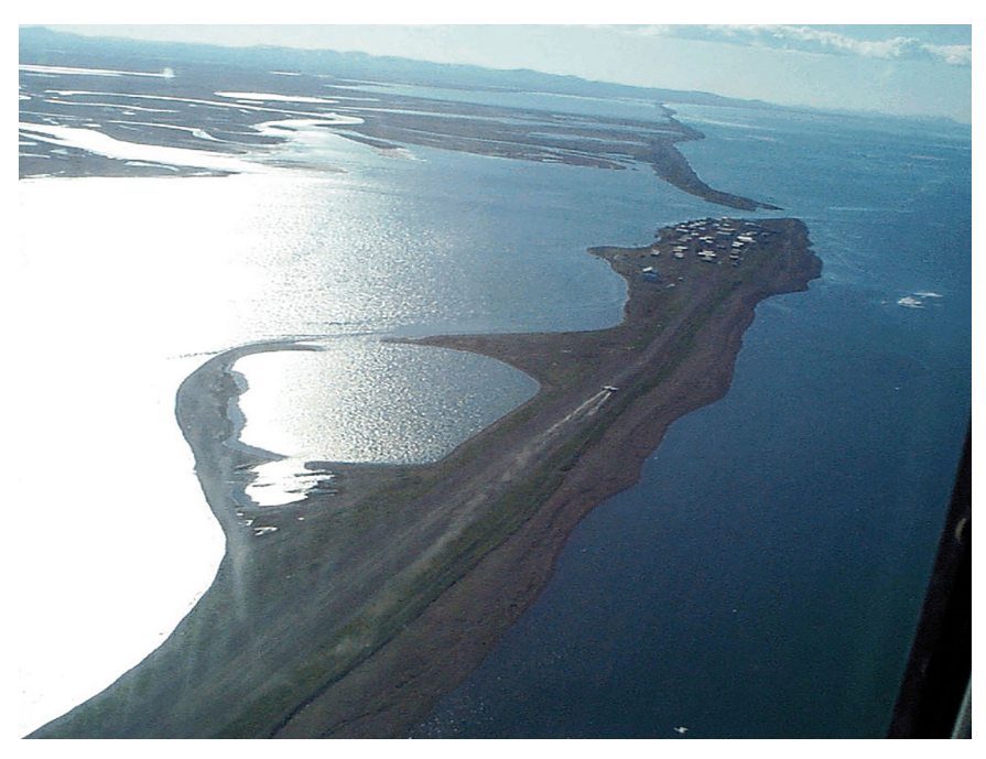
Fig 3. The Alaskan village of Kivalina is at risk from climate change. (Creative Commons license: https://commons. wikimedia.org/wiki/File%3AKivalina_Alaska_aerial_view.jpg).

https://doi.org/10.1371/journal.pbio.2006004.g003