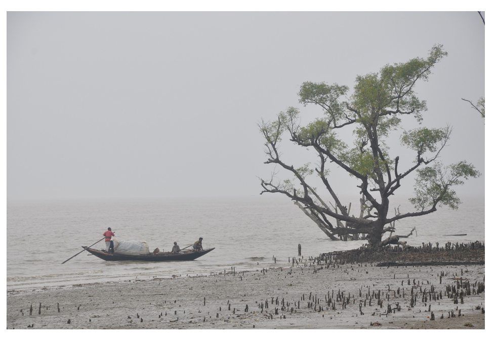
Fig 2. Coastal salination from sea level rise in Bangladesh. (Open Access license: https://pixabay.com/en/boat-seasundarban-tourism-nature-1511602/).

A snowball represents weather. A retreating glacier represents climate change. This crucial distinction renders the former scientifically ludicrous and the latter a valid illustration of climate change that can legitimately be used for affective engagement with the public. Any image,