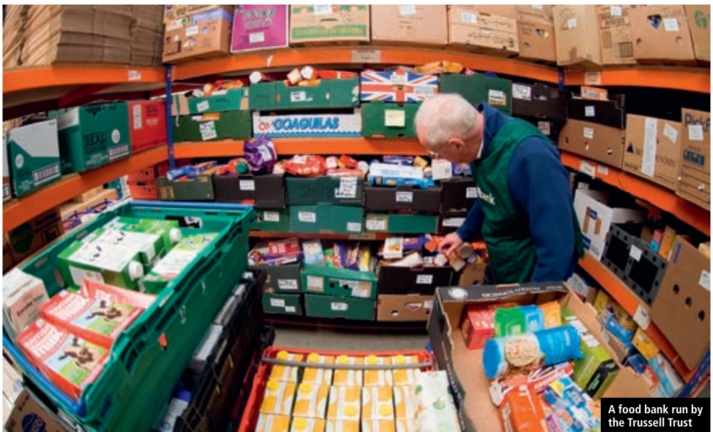
A food bank run by the Trussell Trust

This might suggest people in Greenwich have greater access to emergency food, but all the food banks in Greenwich are run by the Trussell Trust, which operates a referral system and three-visits rule. In Tower Hamlets, the First Love Foundation's two food banks have similar rules. However, people can approach Bow Food Bank without a referral, choose the food they need, and visit up to 15 times.