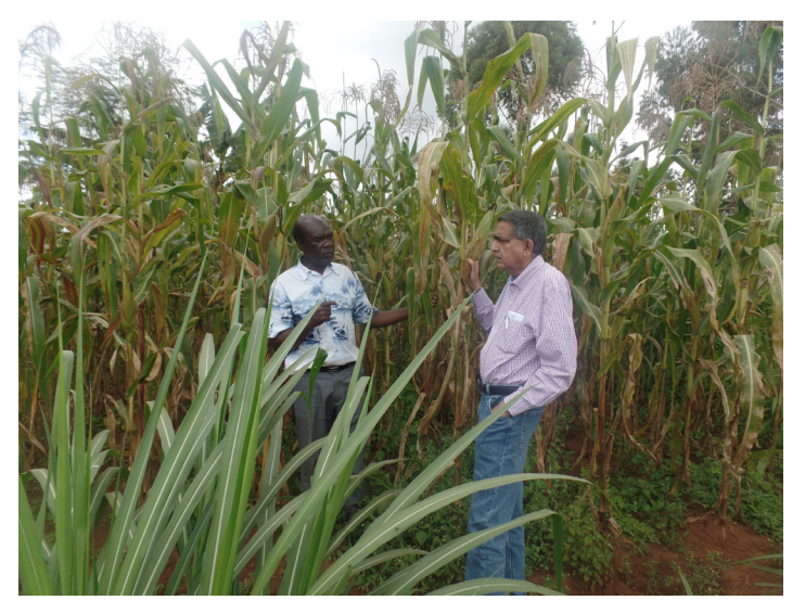
Figure 5. David Okiya's push-pull field unaffected by FAW.