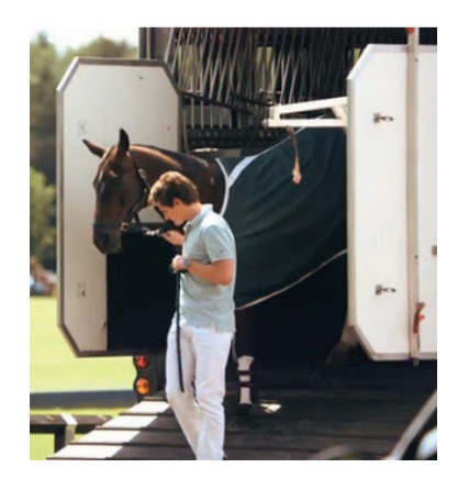
Figure 6 Etonian leads his horse out onto Guards Polo club for the Varsity Match, 2012

Figure 5: Jack Wills Varsity Polo, Guards Polo Club, June 2012