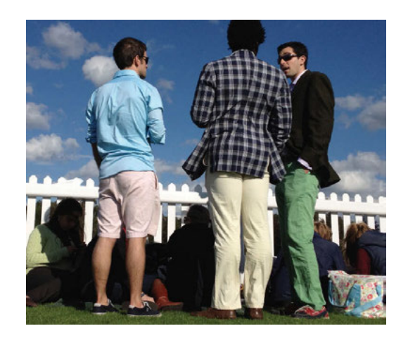
Figure 5: Jack Wills Varsity Polo, Guards Polo Club, June 2012