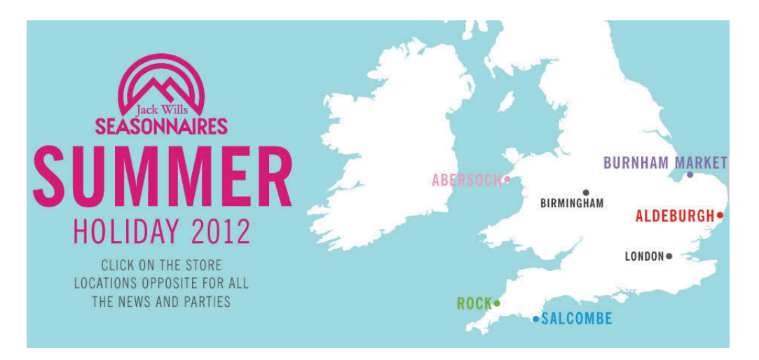
Figure 9 Jack Wills Summer 2012: the heraldic use of colour for competition between seasonal activities

Moor has recently argued that brand promotion (2003)is an extending/embedding of itself within spatial patterns of everyday life. Promotion provides not an enticement of purchase but 'a remembering of the event' (2003: 50). The colours are used to recall the summer season but also links into the brand's concern with fiduciarity. As the colours-schemes refer back in time to the British ancestors who founded them in aristocratic houses, elite schools and universities, they also project a notion of redeeming these traditions through involvement in the activities in the present. In so doing, colour acts an oblique symbol of alliance between groups to marshal them to this common activity of upholding these British traditions and the gentrified lifestyle.