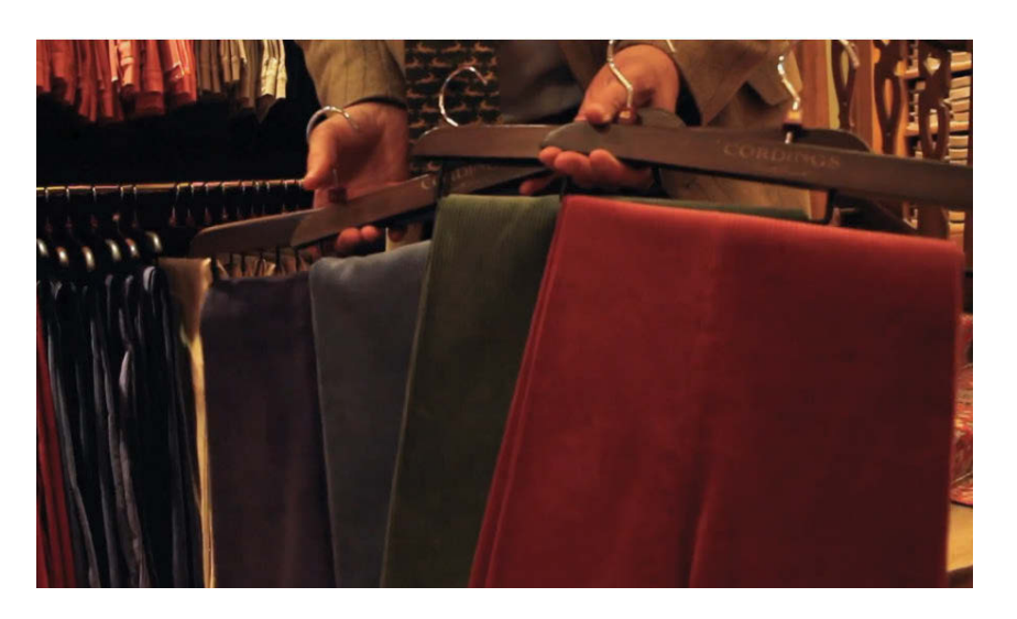
Figure 8 Cordings/Jack Wills 'dandy coloured cords'

With the colours being used as honorific devices, the distribution of Jack Wills clothing is by implication the distribution of elite colours – that is, colours which are designated for elite persons. The lifestyle events – as Figures 5-7 show – demand the adoption of these colour schemes as appropriate attire and their distribution at key lifestyle enclaves is bound up with the distribution of free clothing to those befriended by the Seasonnaires. In the granting of free clothing, the Seasonnaire are also gifting the honour of colour wearing. These colour schemes, distributed at key localities, are a unifying symbol of membership to a social group. The colours are intimately related to a gentry tradition from heraldry, to public schools and finally to Jack Wills; they are not corporate colours (Coca-Cola red or Pepsi blue) but gentry colours referring to the social group itself.