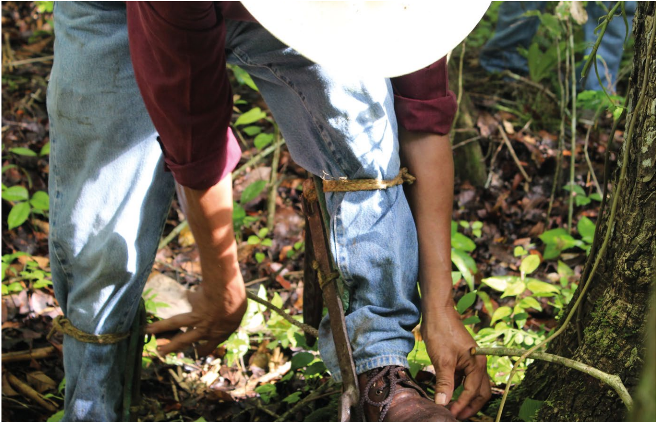
Figure 5 Jorge Soza demonstrates the extraction of chicle, a sustainable technique practiced in the Petén (Guatemala) between the 1920s and 1960s