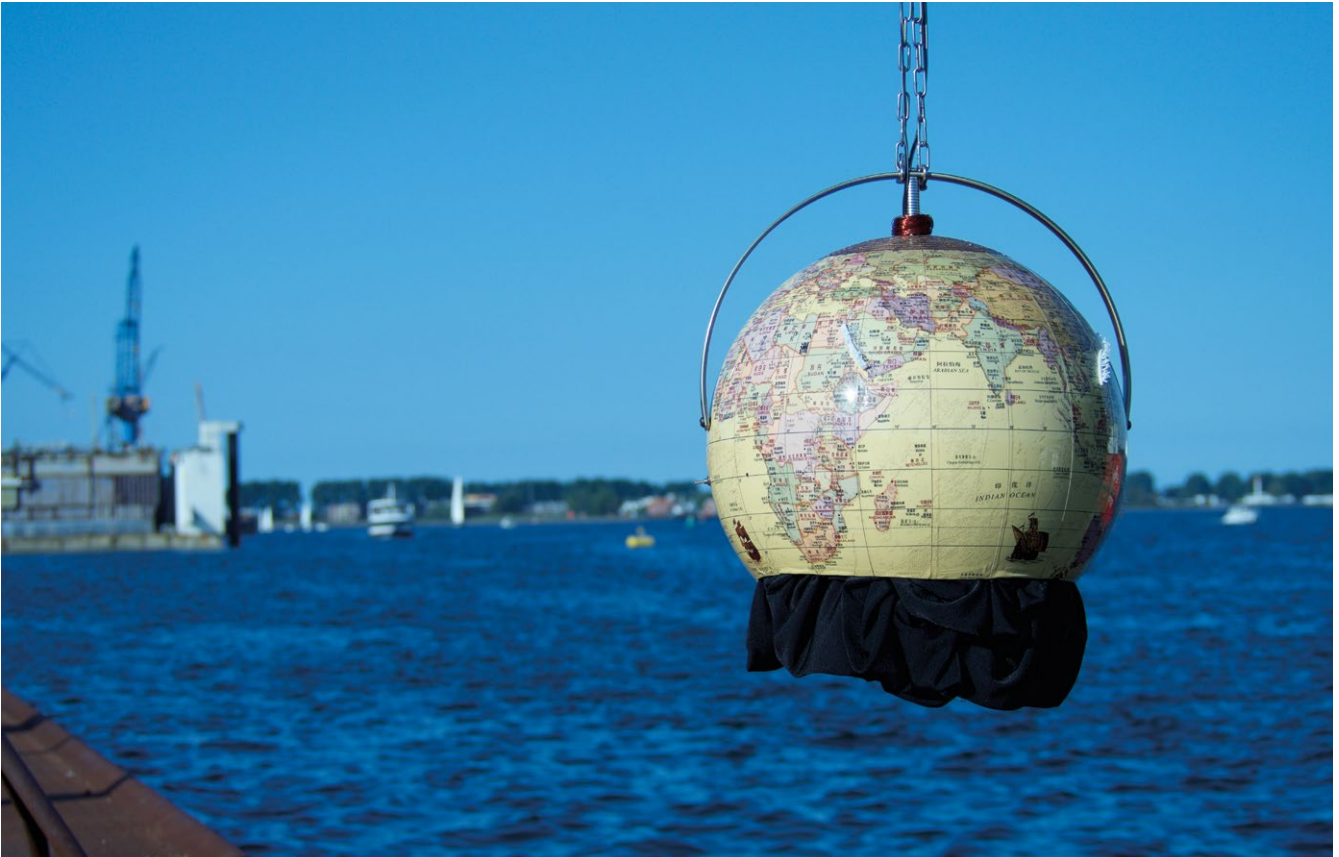
Figure 1 Austen's Coral Empathy Device.

In a second example of experimenting with giving voice, the artist-researcher Kat Austen sought to call forth empathy with, and embodied knowledge of, a marine environment that is being altered in anthropogenic ways. 52 Austen used sound recorders to map an underwater environment in Bergen, Norway, also measuring the levels of microplastics detected in nearby algae. She transduced her recordings into analogue vibrations of sound, touch and smell, creating an embodied interface in the form of the 'Coral Empathy Device', a multi-sensory headset worn in order to re-present the processes through which the coral is affected by its environments. Austen's aim was to create a conversation between humans and coral, allowing us to perceive other worlds and very different spatio-temporal scales ( Figure 1 ).