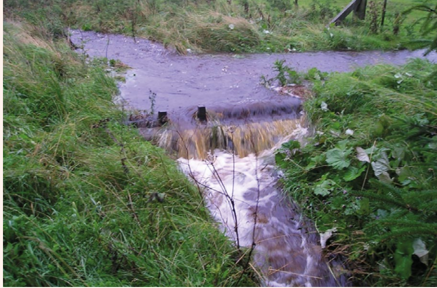
Figure 3 Upstream bund diverting flow into field.

▼ Through intentionally building stages and spaces for the intermingling of human and non-human agencies, and slowing practices down, hybrid forums of knowledge and expertise can offer innovative practical and political responses. ▲