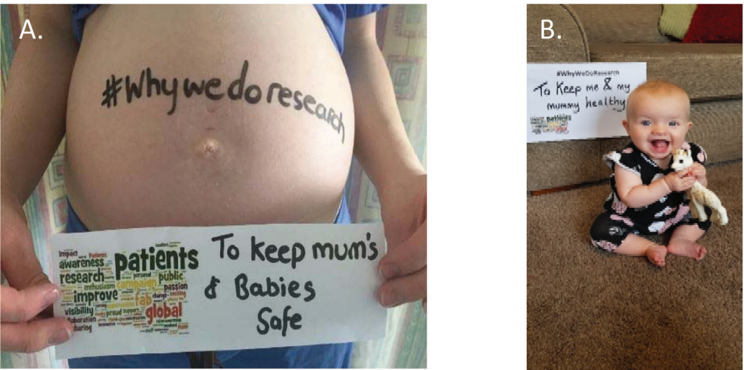
Figure 1: Representative images from the #WhyWeDoResearch campaign A. An expectant mother stating that she takes part in research to keep mothers and babies safe B. A baby with a placard important to her mother