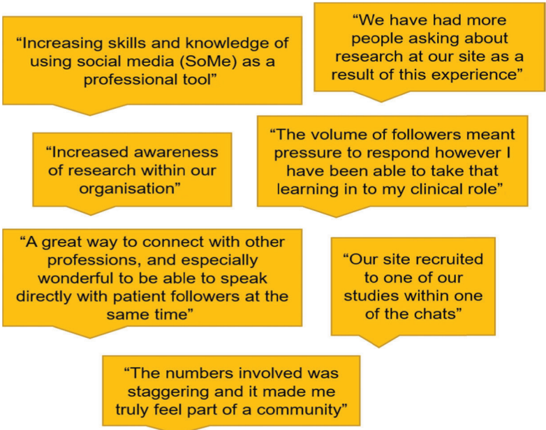
Figure 6: Qualitative feedback collected from tweetchat hosts

and sharing of ideas and knowledge. While limitations of the social media platform should be acknowledged, it is also possible to overcome these with preparation and perseverance, and when compared to the available benefits, the limitations pale in comparison.