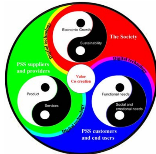
Fig. 2 The conceptual framework of value co-creation in PSS

individual element, there is different focus. For example, PSS providers (integrators) together with suppliers focus on the system integration, synchronisation and convergence of their products and services. Meanwhile, PSS customers and end users add their inputs to receive the functional, emotional and social satisfaction by dialogue with PSS providers. All these activities will inevitably be linked to the surrounding society that promote joint efforts to achieve both economic growth and sustainability. Therefore, the framework can be used as an education model and guide for all PSS actors including suppliers, providers, customers, decision makers and the wide public who are seeking for value co-creation for sustainable development (e.g. the circular economy).