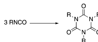
Scheme 1 Trimerization of isocyanates.

Trimerization of isocyanates (RNCO, Scheme 1) is the most rapid, economical and atom-efficient route to isocyanurates, which are used in a diverse range of applications, such as medicines, 2–5 selective anion binding, 6 microporous materials 7,8 and coating materials. 9 However, isocyanurates' principal application is in the construction industry; they are the key component in rigid polyurethane foams which are used ubiquitously as insulation