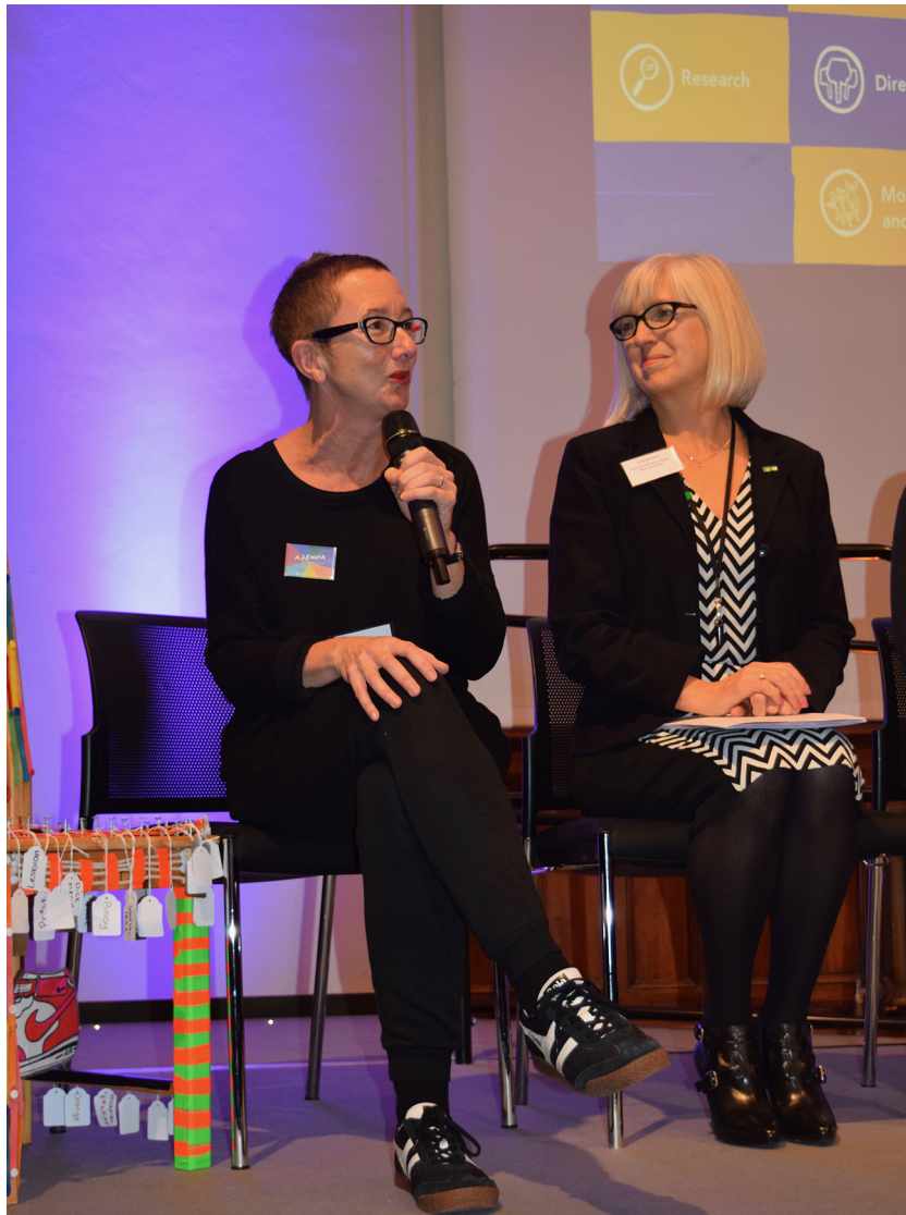
Fig. 8. Chairing the panel.

The anti-chair-body has accompanied us into places and spaces that young people do not always want to participate in.