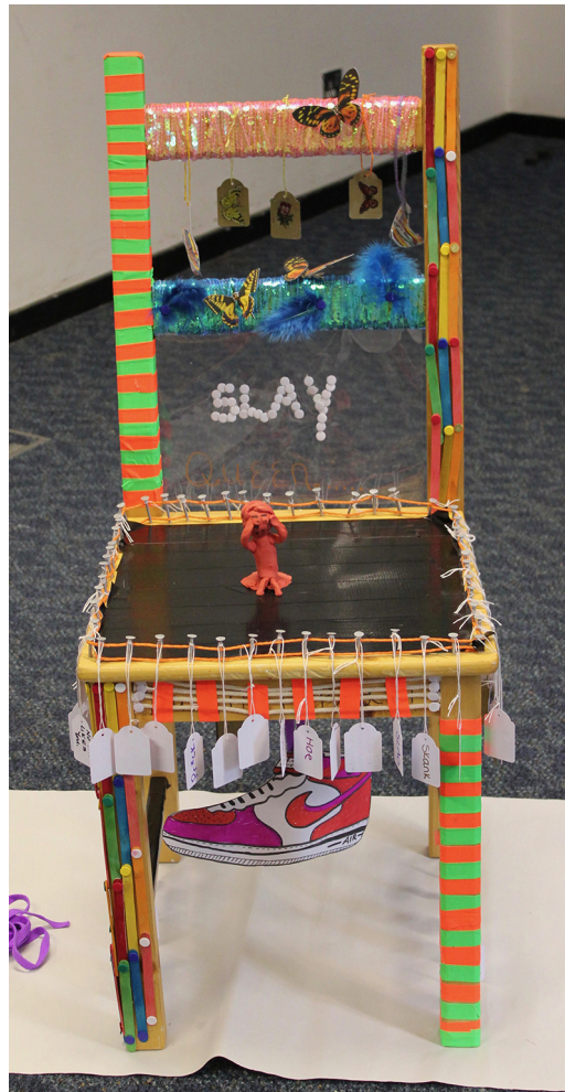
Fig. 3. Anti-body-chair.

sobbing figure out of plasticine. The group placed the figure on the centre of the blackened seat. Objects seemed to carry affective residues for the group which worked to bond rather than break the group apart (Bennett 2010). Simultaneously, as the tiny sobbing figure was positioned, the tall uprights of the chair became embellished with pink and blue sparkly, sequenced thread. More labels appeared, coloured in pure gold, with no words and were hung from the upright. Negative labels remained attached to the seat, as if taking a back seat. Taylor designed a piece with the Beyonce slogan “Slay-queen” (see Chatzipapathodoridis, 2017), created from drawing pins tacked into a sheet of clear acrylic and which stretched across the lower back. He also designed a cut-out of a colourful NIKE shoe, a corporate ‘just do it’ global symbol of movement, was slung beneath the seat as if lending the chair legs – a swinging swooshing undertow. Butterflies were clipped to the vertical uprights, hovering and fluttering lending it wings. Feathers barely attached, shimmered as they caught the sunlight streaming in from the window. One of the uprights became wrapped with luminous orange and green tape suggesting a warning or maybe a protecting, or safe-guarding of some kind?