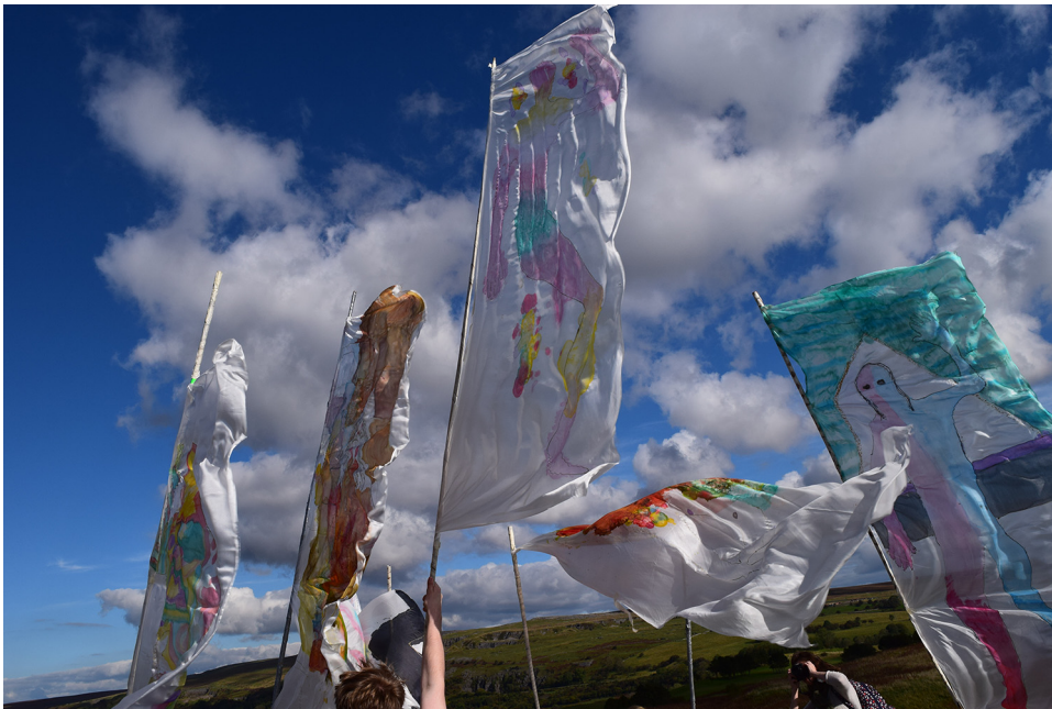
Fig. 5. Bodies in Flight.

categories, or explosions of rage, now seemed filled with more affirmative feelings; feelings set in motion by swinging, flying, plunging through the air in ways that ‘intensified the power of existence’ (Massumi, 2015: 44).