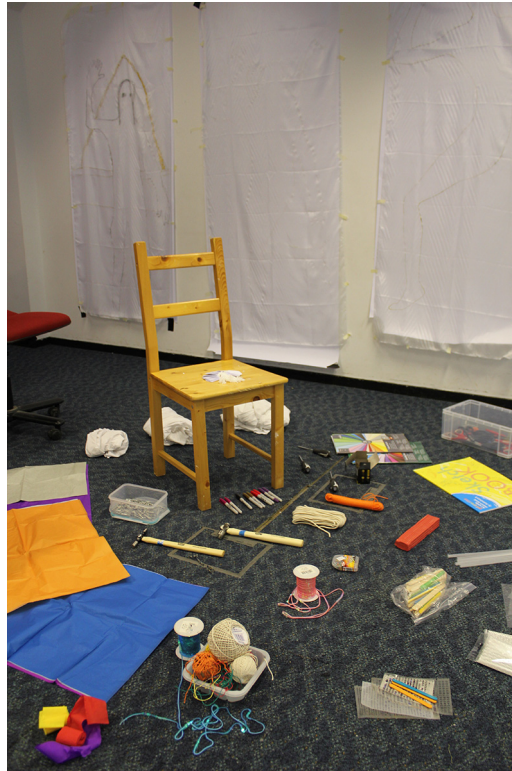
Fig. 2. Chairing the assemblage.

us to the edge; an edge where the present vibrated with ineffable sensations of the near-past physical activities, and perhaps echoes of prehensions from the virtual past of mining life. The long piece of paper that we used to capture these traces came to be known as the ‘run(a)way’ because it landed affects as pictorial, collective marks in ways the kept things moving, ‘inventing its own way’ (see Renold, 2018)