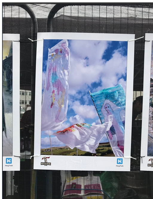
Fig. 7. Railing Silks.