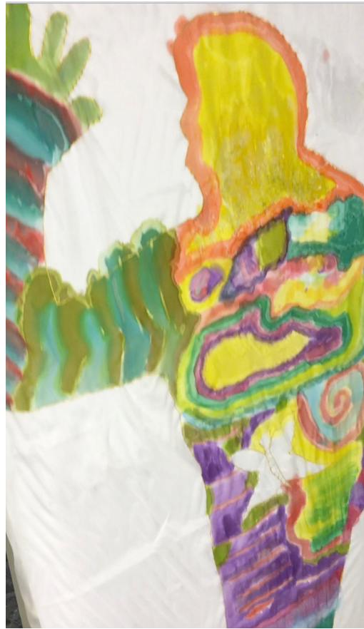
Fig. 4. Butterfly Silk.

prehensile space between the virtual and the actual and borne of an artful process that included crafting an intervention from attuning to the rage, desire, pain and loss we had encountered with the group in prior meetings. The chair went on to do huge amounts of work, chairing a micro politics of e/affect that we describe later.