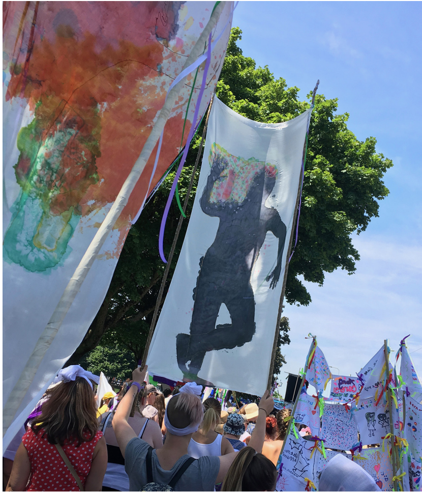
Fig. 6. Processions.