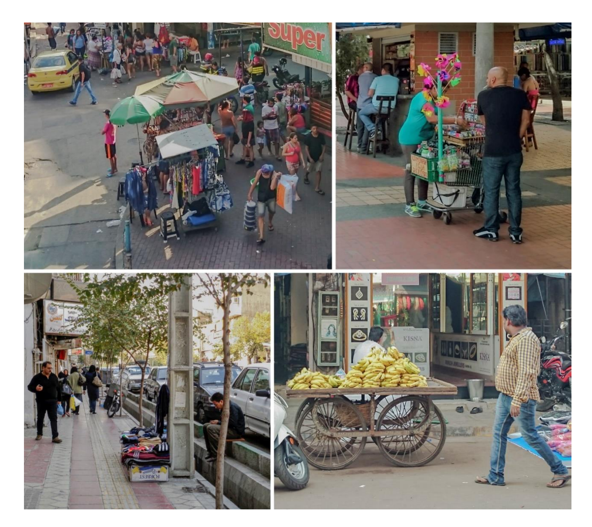
Figure 3. Detached/Semi-fixed type of street trading in Rio de Janeiro, Brazil ( upper Left ), Medellin, Colombia ( upper right ), Tehran, Iran ( lower left ), and Mumbai, India ( lower right ).