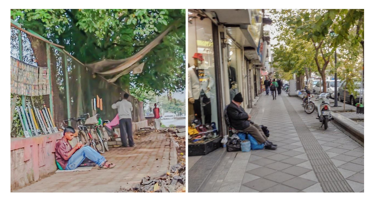
Figure 5. Adjacent/Unfixed type of street trading in Pune, India ( left ) and Tehran, Iran ( right ).

This type refers to a condition where street trading is attached to the edge of public space, yet capable of possible relocations within public space. As shown in Figure 5, the establishment of this type often relies on the availability of certain types of public/private interface along the edges of public space. Impermeable public/private interfaces, such as blank walls and fences, have the affordance of becoming appropriated by this type of street trading (Figure 5). In this case, such urban interfaces also contribute to the visibility of this type as they provide a visual framing in the form of a blank background. A limited number of products can be temporarily hanged on such edges of public space as the offered products in this type need to be carried by one person (Figure 5). Nonetheless, not all of the impermeable public/private interfaces are likely to be appropriated by this type of street trading because the location is also linked to the proximity to pedestrian flows. A key feature of this type is its capacity to work as a temporary intervention at the micro scale to transform and revitalize those inactive edges of public space that have been produced through formal processes of urban development.