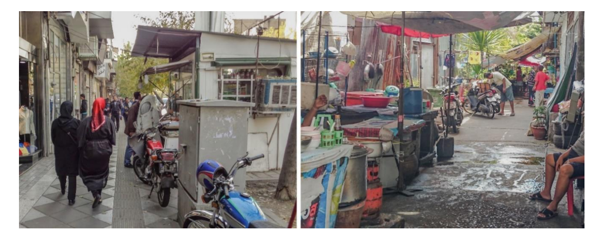
Figure 4. Detached/Fixed type of street trading in Tehran, Iran ( left ) and Bangkok, Thailand ( right ).