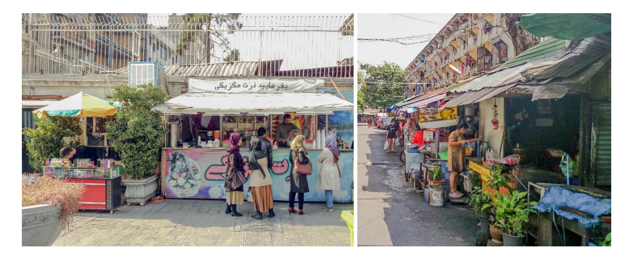
Figure 7. Adjacent/Fixed type of street trading in Tehran, Iran ( left ) and Bangkok, Thailand ( right ).