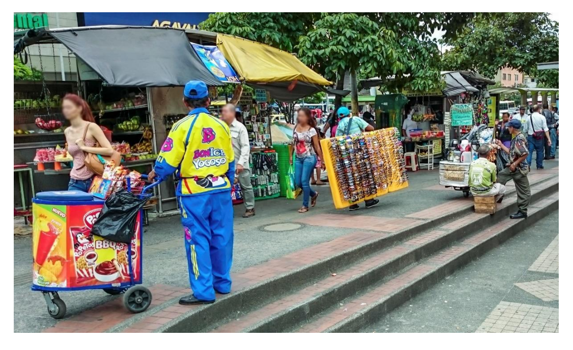
Figure 8. A mix of types with different catchment areas. Different types of street trading that co-exist within public space in Medellin, Colombia.

Thus far, we have introduced the developed typology and described the main characteristics of each type. Nevertheless, as the outlined criteria—proximity to public/private interface and mobility within public space—form continuums, a range of in-between conditions and possibly other types can also be identified. This can, in turn, potentially increase the overlaps between them. There is no claim here for developing a comprehensive typology of street trading as some of the outlined types have not been entirely settled, and there is also possible slippage between them. It is often impossible to draw clear-cut boundaries between the identified types where one type can become another in response to the dynamics of control in public space. These types are neither archetypes nor mutually exclusive as they may also coexist within a public space at the same time (Figure 8). In this section, we focus on the synergies and contradictions between the outlined types of street trading in negotiation for space and visibility.