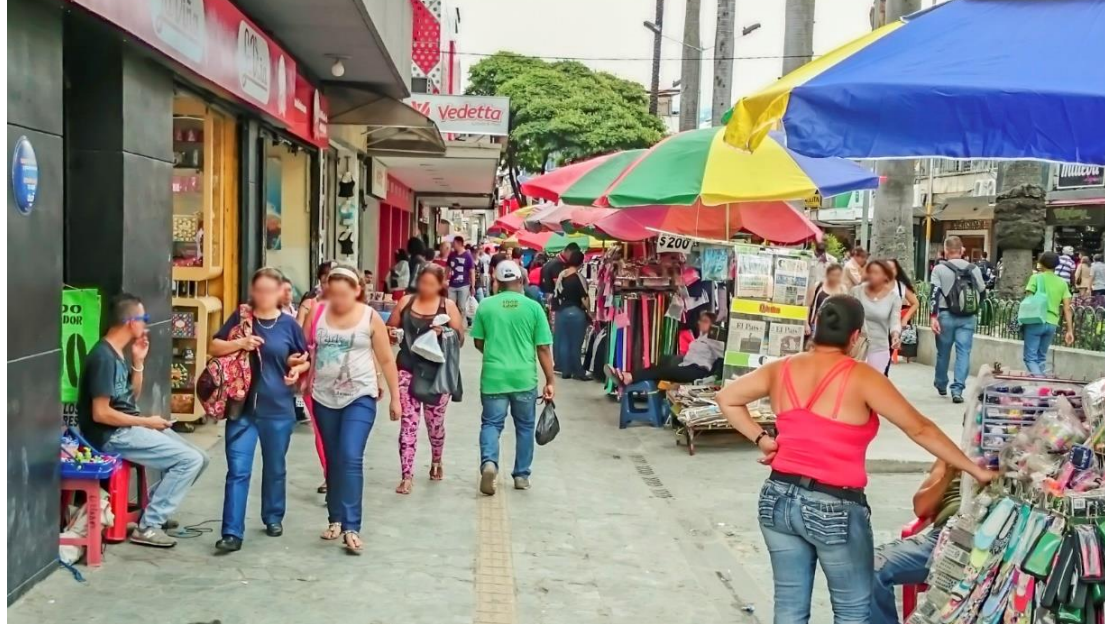
Figure 9. Street trading as a micro-scale design intervention that can bring vitality to public space. Medellin, Columbia.

Street traders negotiate their visibility and use of space not only with each other but also with formal businesses. Land in the public realm is an asset for street traders to manage livelihoods yet is subject to a range of contested claims, which have remained underexplored [59] (p. 239). While street traders and shopkeepers may even collaborate to further materialize their claims over public space, they often play a contradictory role in relation to each other. Street traders generally appropriate those parts of public space with high pedestrian flows. The presence of street traders and their capacity to make use of loose elements (e.g., pushcarts, goods, tables, and food stalls) can contribute to the flexibility of use and attract high volumes of pedestrian traffic. This is a win-win situation for both informal traders and shopkeepers as long as the excessive concentration of activity pockets does not escalate to the blockage of pedestrian flows. It is then critical for both street traders and shopkeepers to keep pedestrian flows open. Excessive appropriation of public space may otherwise produce severe competitions and gridlocks due to which many traders will leave their territories [41]. While both