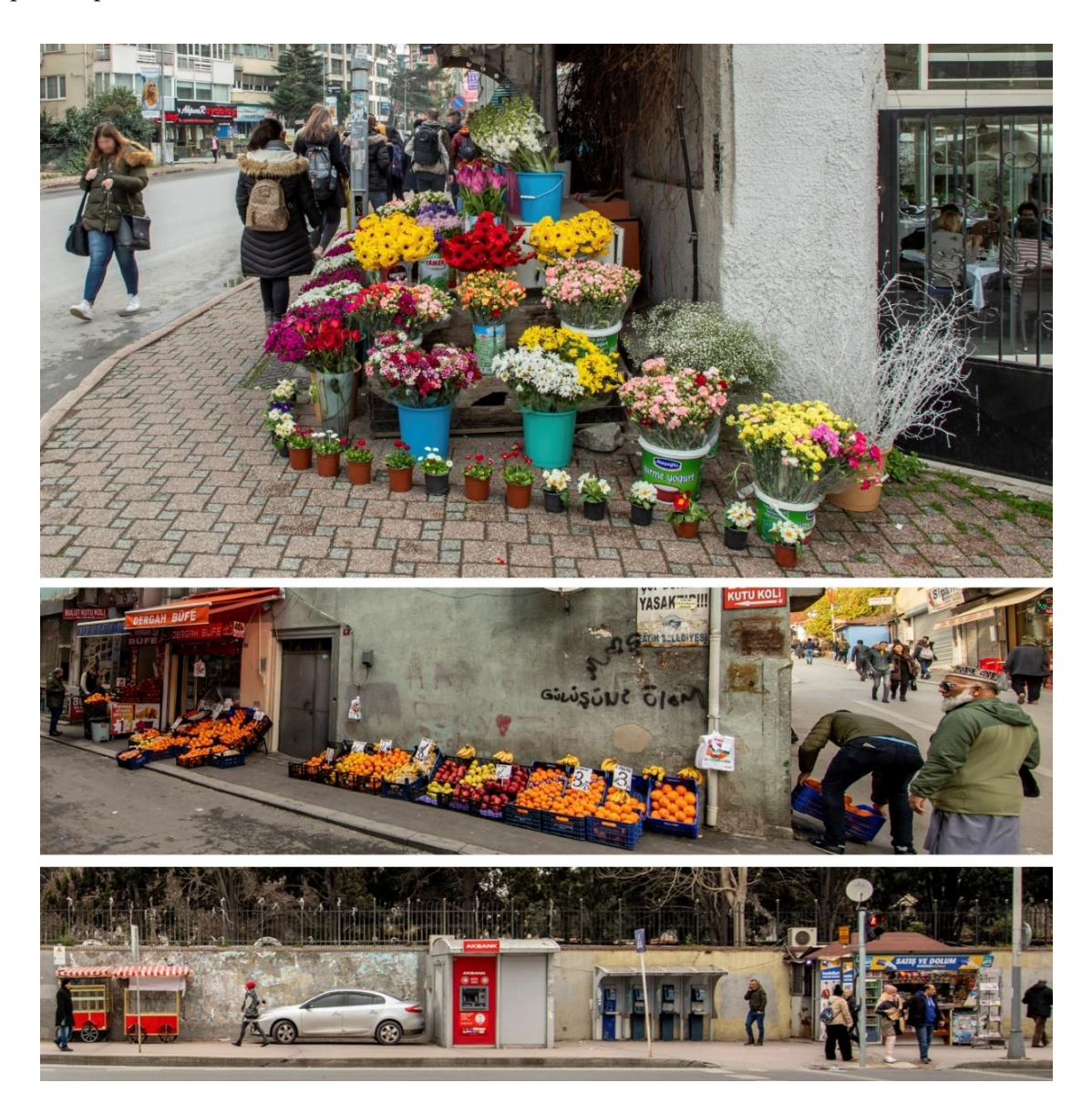
Figure 10. Territorial claims over public space can be tolerated or resisted in different ways depending on whose right to public space is favored. Impermeable interfaces are transformed in many ways by materializing different claims over public space in Istanbul, Turkey.

or disadvantaged in accessing prime locations [39] (p. 186). Exclusionary practices also apply to specific types of street trading. Exploring the prevalence of different types and their positioning in relation to each other in public space is beyond the scope of this paper yet critical to provide a better understanding of how certain types are more likely to be excluded in fierce competitions over public space.