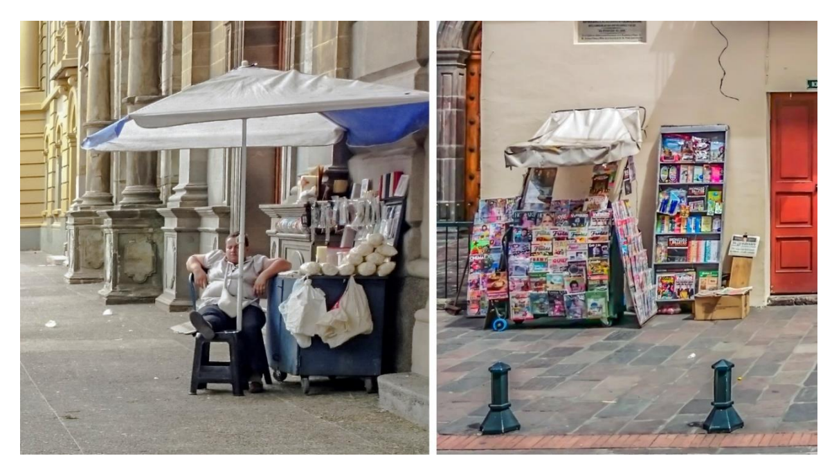
Figure 6. Adjacent/Semi-fixed type of street trading in Medellin, Colombia ( left ) and Quito, Ecuador ( right ).

This type refers to a condition where street trading is attached to public/private interface, yet not fixed in its current location. As shown in Figure 6, products are often carried around using a fairly small carrier (e.g., pushcart, trolley). This type has the capacity to move within public space in response to the changing pattern of pedestrian flows. However, this capacity is conditional to the number of products and size of the carrier. This type is generally found along the impermeable public/private interfaces where a formal attraction does not exist. Blank walls, fences, and unused entrances along the busy parts of public space are likely to be appropriated by this type of street trading (Figure 6).