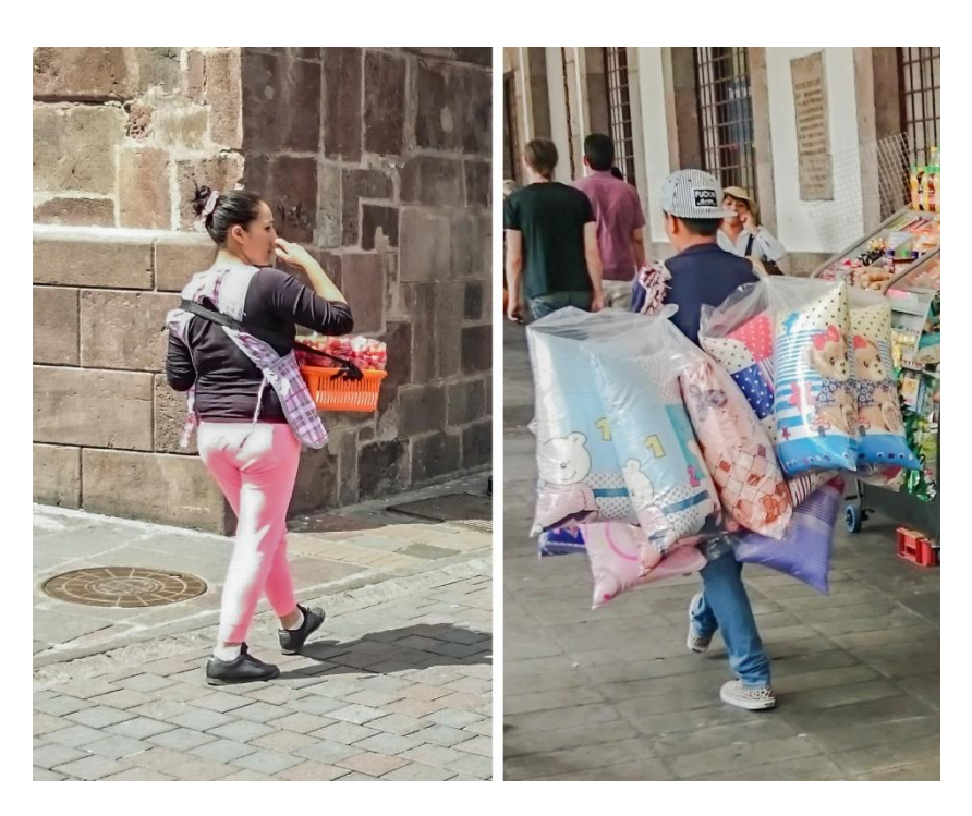
Figure 2. Detached/Unfixed type of street trading in Quito, Ecuador.

This type refers to a condition where street trading takes place detached from public/private interface with a high capacity to move within public space. As shown in Figure 2, this type is highly adaptable to the rhythms of pedestrian flows as it can quickly move around and become more visible to potential customers. Hence, it is quite competitive in the temporal appropriation of public space and negotiating visibility to the public gaze. The high level of mobility provides the possibility of appropriating different parts of public space; it can also penetrate areas that are not accessible by other types, such as the interiors of public transport services. The range and volume of products are of course, quite limited.