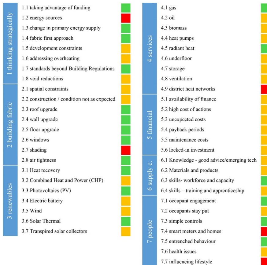
Figure 1. Grouping common retrofit actions into a ‘what works’ classification