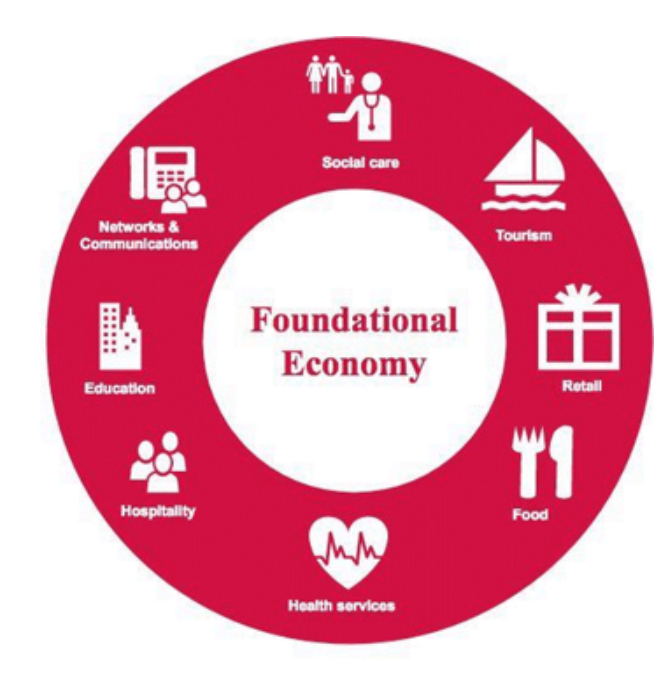
The foundational economy encompasses a range of different areas, as shown above.

Traditionally, public policy has most overlooked the foundational economy. In part this was because of its <u>low wage</u>, <u>low</u> <u>skilled and perceived low value</u> <u>composition</u>. Yet it is largely local and rarely bought or sold outside of the UK meaning the sectors are <u>resilient to</u> <u>economic shocks</u> like Brexit. When measuring the economic impacts of the UK leaving the EU, <u>predictions are being</u> <u>made based on dependency on EU trade</u>. Since foundational sectors are less