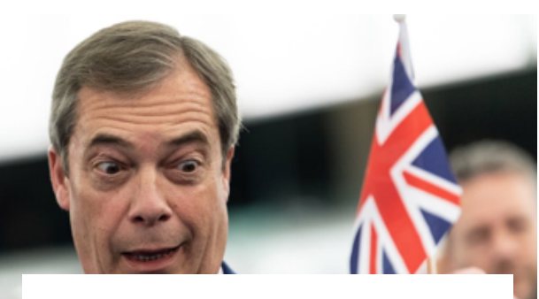
How Brexit brought Britain's constitution to the brink

People's Vote march: when it comes to crowds, history shows it's not all about size