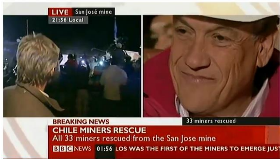
Figure 5. At the end of the rescue, the BBC portrayed in different ways the families and the president.

The shots of this scene focused on Urzúa and the president, offering a few general images of the surroundings but several close-ups of the faces of both men, in what may give the impression that the miner and the authority were represented at the same level. However, a closer analysis shows that most of the time the shots were following the facial expressions of the president. A particularly revealing moment occurred when the screen was split in two, and the BBC's additional camera depicted the celebration of the families in a distant, barely visible panoramic shot, a huge contrast with the close-up centered on the face of Sebastián Piñera (Figure 5).