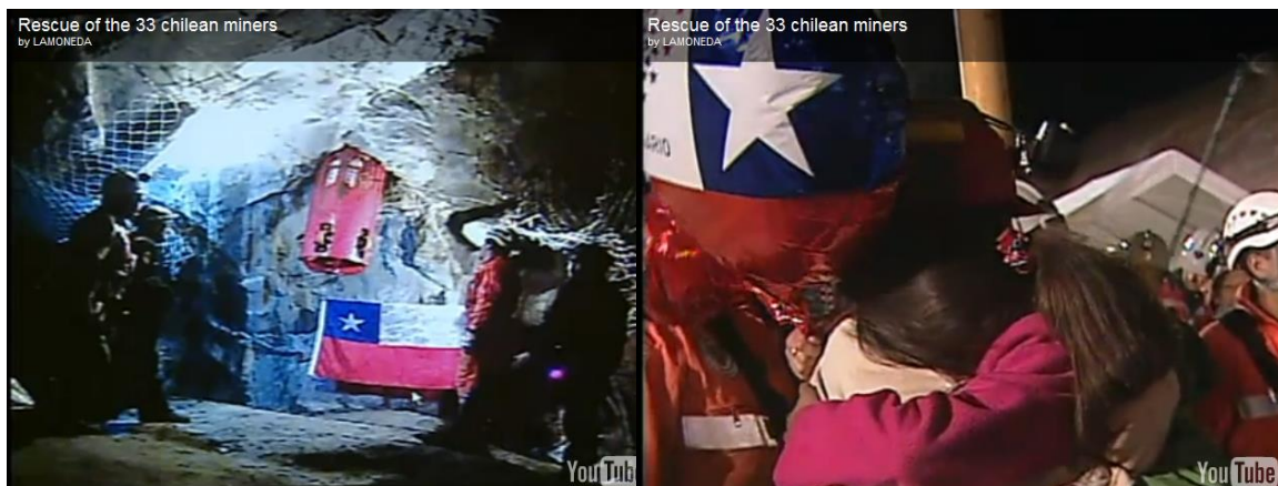
Figure 2. Two examples of Chilean flags displayed, one inside the mine, another one in a balloon.

There is a constant display of national symbols, in the form of Chilean flags of different sizes inside and outside the mine as well as on the clothes of the miners and on the machines used for the rescue (Figure 2). This emphasis on nationhood—a feature commonly found in media events—may not only be directed at local audiences but can serve to create a bond with the rest of the world (Dayan & Katz, 1992).