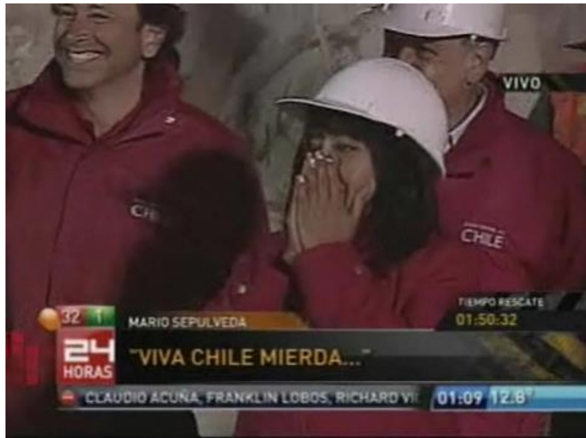
Figure 4. "Viva Chile mierda" appears on screen.

Accompanying this euphoric atmosphere were remarks about the historicity of the occasion. The commentators emphasized the unprecedented nature of the rescue, stressing the low chances of survival the men originally had or simply stating that all these were moments of enormous importance. This historicity was interpreted as both a source of pride for Chile and admiration from the rest of the world: