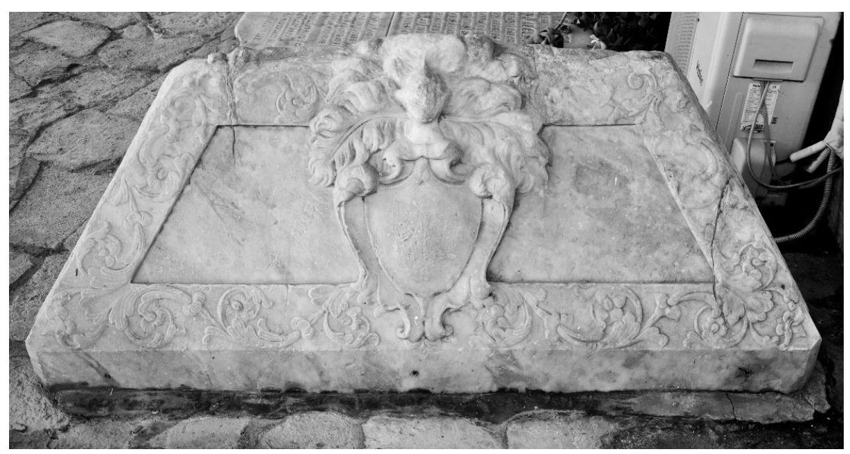
Fig. 14. Tomb of William Ken (1707, no. 7) (photo. Denys Pringle).