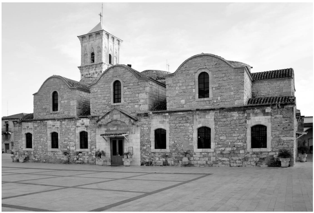
Fig. 1. Larnaca: The church of St Lazarus, from the north.