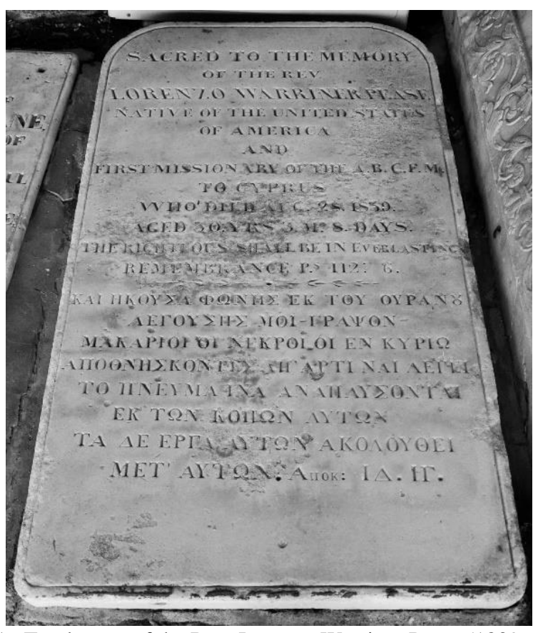
Fig. 21. Tombstone of the Rev. Lorenzo Warriner Pease (1839, no. 16).