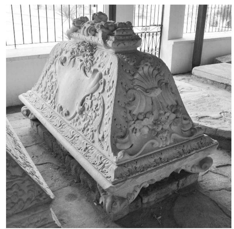
Fig. 16. Tomb of Christopher Graham (1711, no. 8).