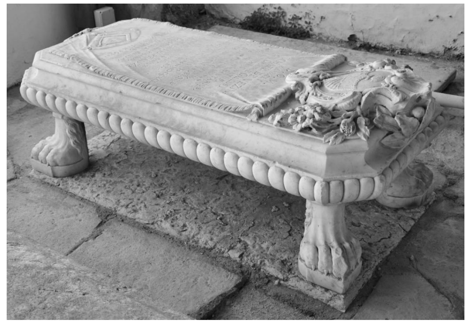
Fig. 19. Tomb of Michael de Vezin (1792, no. 11).