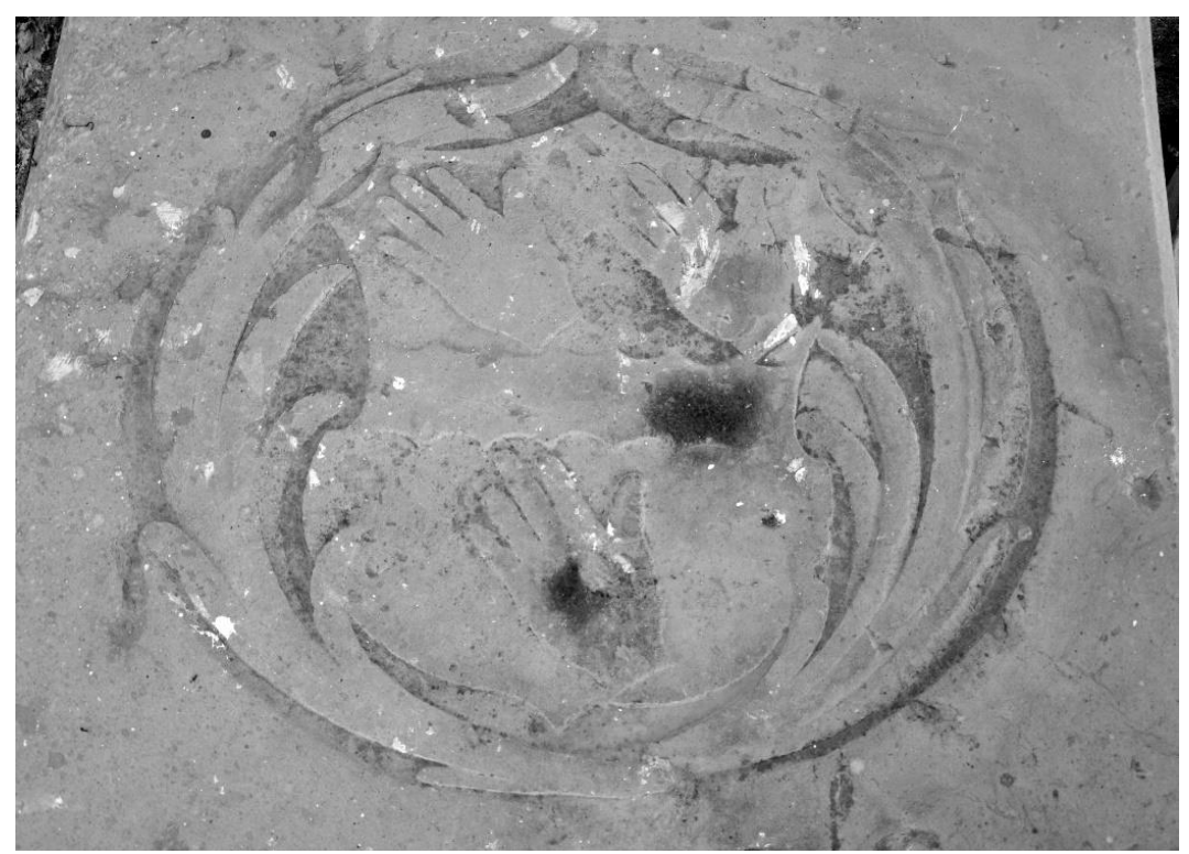
Fig. 12. Tombstone of Robert Bate ( c .1700, no. 6): detail of armorial bearing.