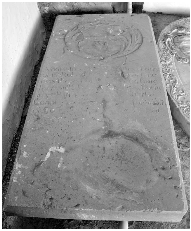
Fig. 11. Tombstone of Robert Bate (c.1700, no. 6).