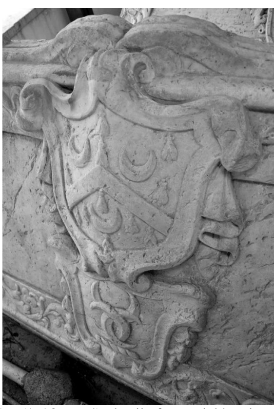
Fig. 8. Tomb of John Ken (1693, no. 4): detail of armorial bearings.