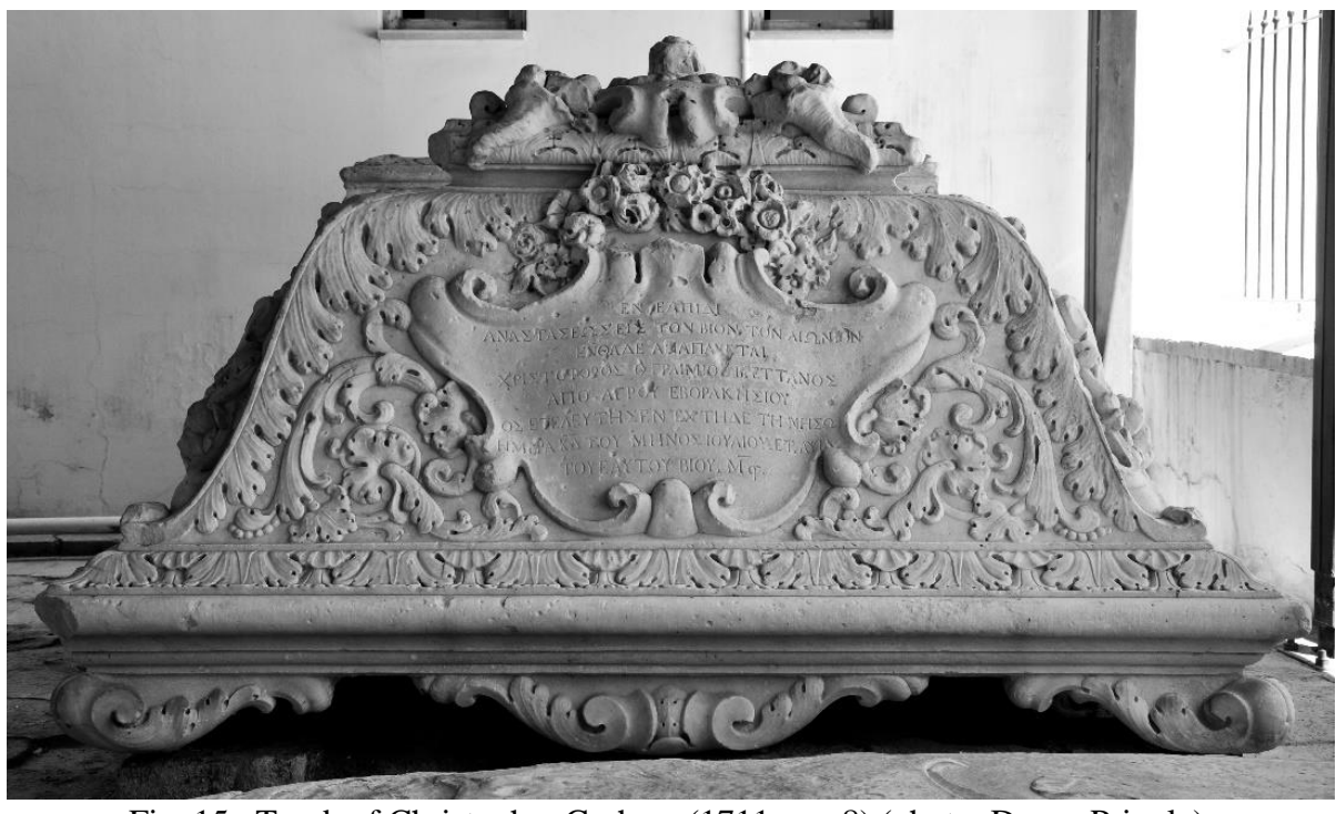
Fig. 15. Tomb of Christopher Graham (1711, no. 8).