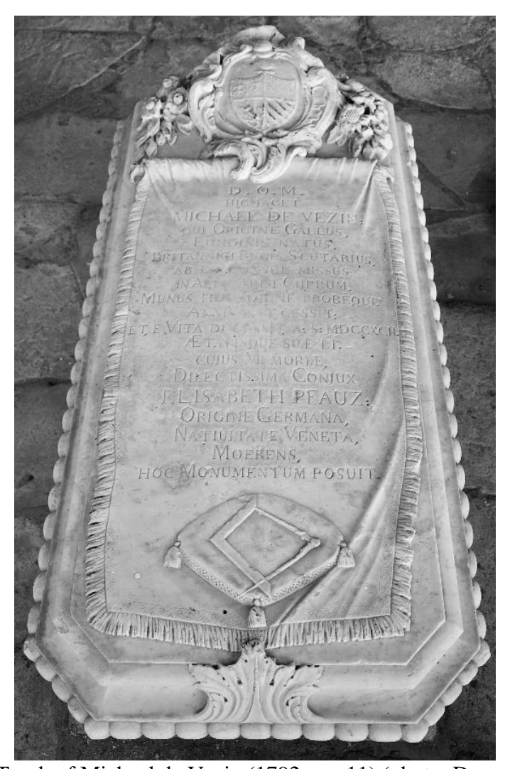
Fig. 20. Tomb of Michael de Vezin (1792, no. 11).