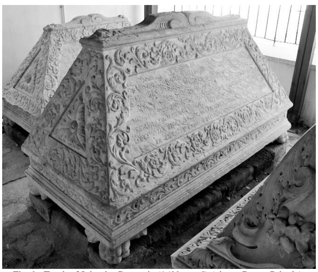
Fig. 9. Tomb of John des Bouverie (1699, no. 5).