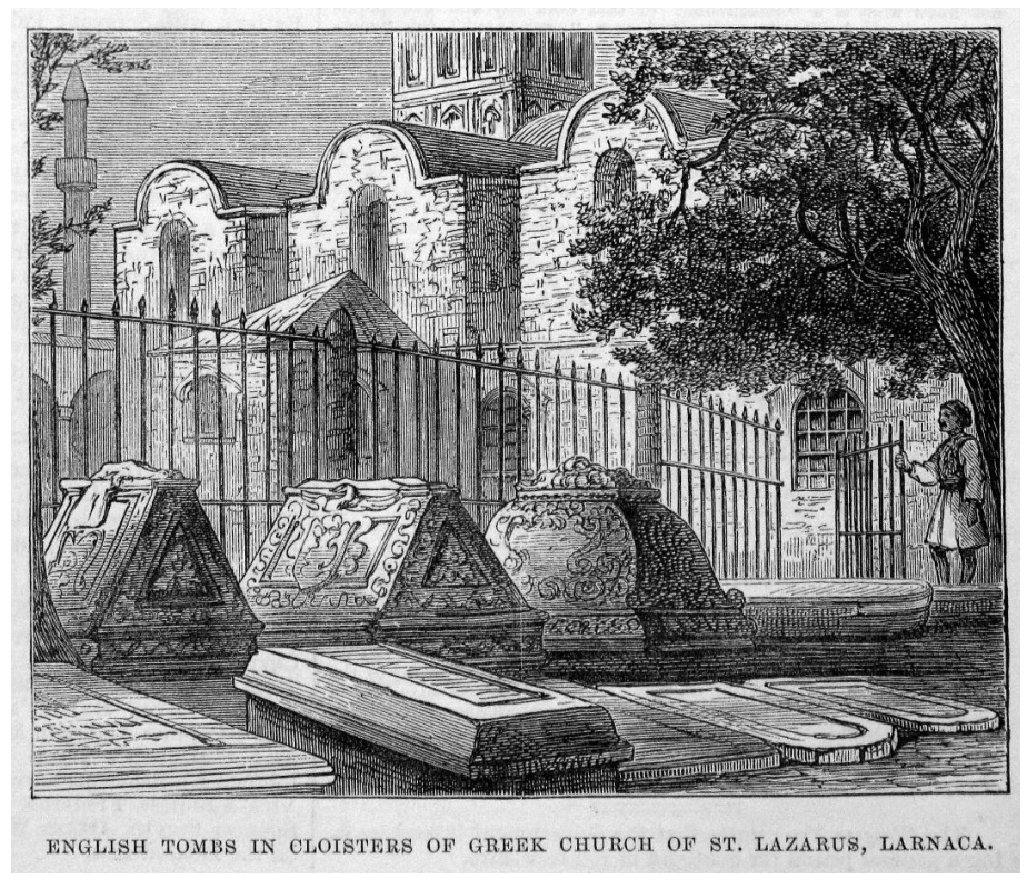
Fig. 2. Larnaca: The Protestant burial enclosure beside the church of St Lazarus (from The Illustrated London News , vol. 73, no. 2049 (5 Oct. 1878), p. 325).