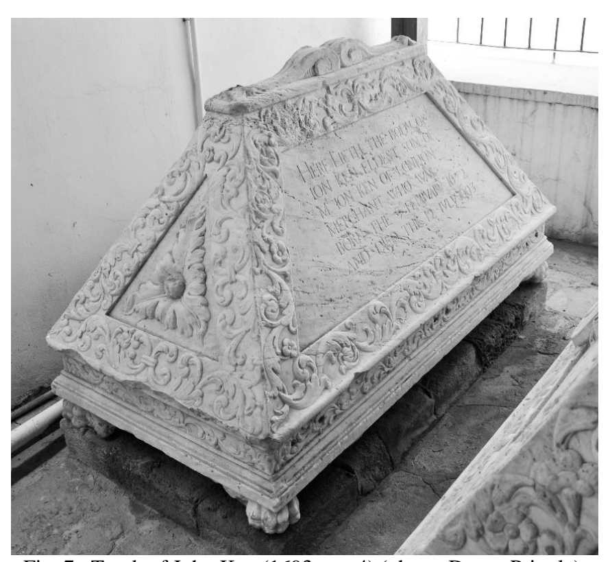
Fig. 7. Tomb of John Ken (1693, no. 4).