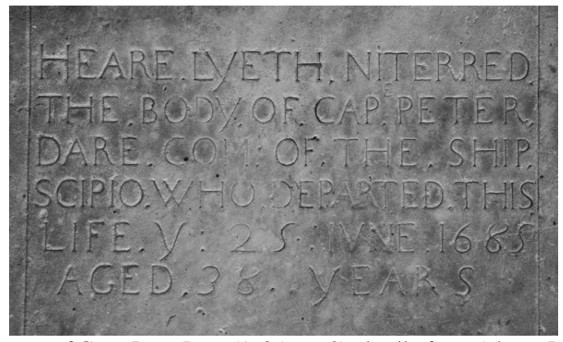
Fig. 5. Tombstone of Capt. Peter Dare (1685, no. 2): detail of text.