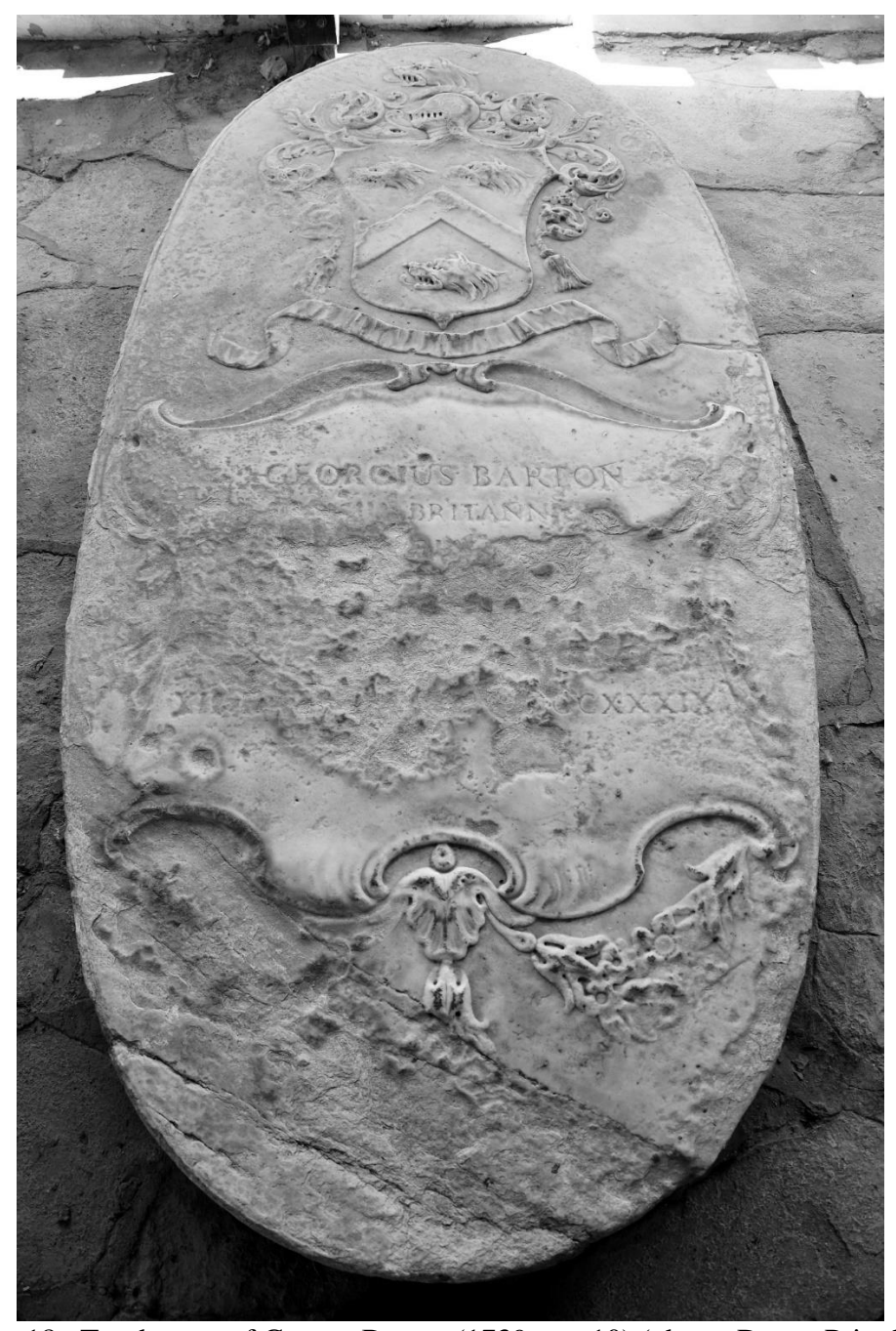
Fig. 18. Tombstone of George Barton (1739, no. 10).