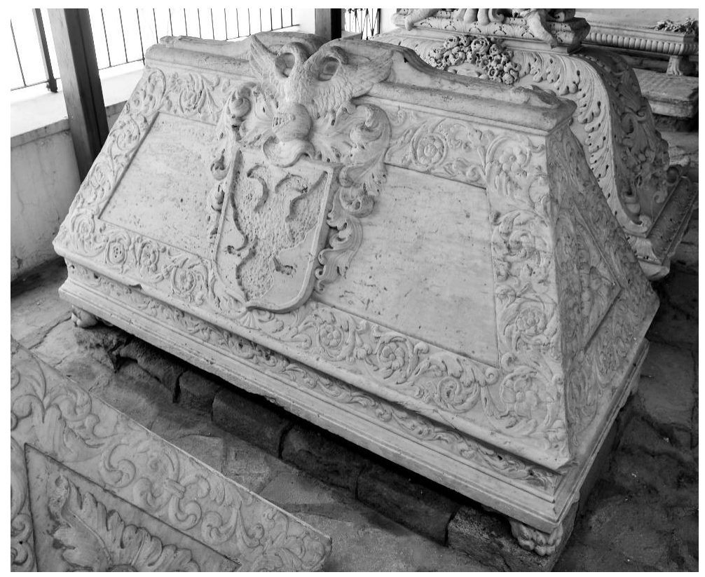
Fig. 10. Tomb of John des Bouverie (1699, no. 5).