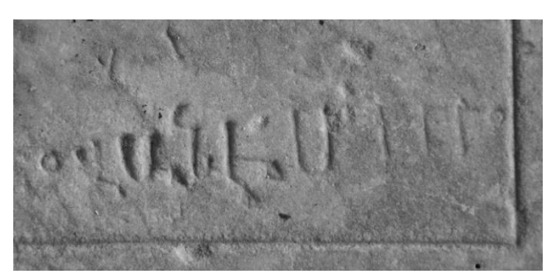
Fig. 6. Tombstone of Capt. Peter Dare (1685, no. 2): detail of Armenian mason's signature.