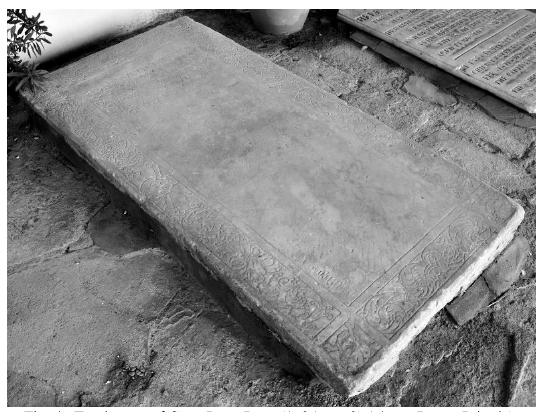
Fig. 4. Tombstone of Capt. Peter Dare (1685, no. 2).