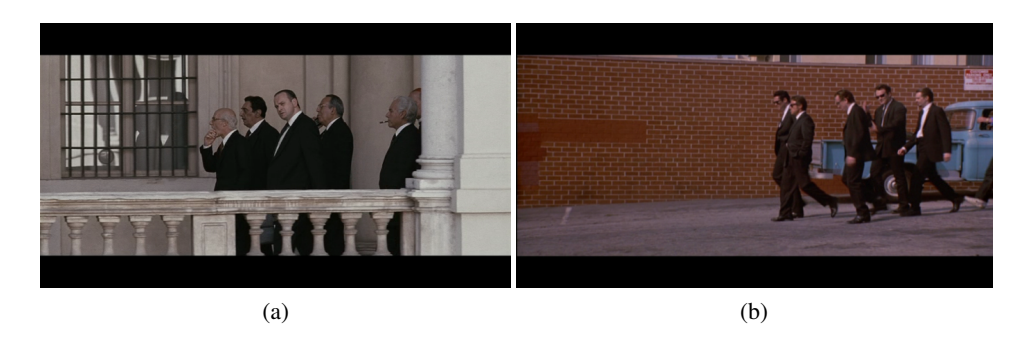
Figure 3: (a) Il divo, (b) Reservoir Dogs

Although these similarities seem far from coincidental, Sorrentino in fact denies having employed any intentional or direct citation whatsoever (qtd. in Piccardi 13). In a sense, though, we might view this point as irrelevant precisely where the citations do not serve as an internalised commentary on the topic (comparisons between Andreotti and Pinhead are ultimately either limited or forced, and risk undermining the complex portrait of the politician). Instead these loose citations are simply integrated into the film's own aesthetics of pastiche, and the director's comments that throw the determinacy of citation into doubt might be viewed as another form of epi-textual persuasion that contributes to an interpretative code. The bracketing or the rejection of the referent here—for in this case the referent is another film, rather than a historical chronicle—fits into and introduces well the wider stylistic approach to historical representation adopted by this film and by Romanzo Criminale .