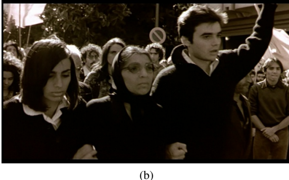
Figure 1: (a) A photograph of Impastato's funeral (from Behan); (b) the funeral sequence in the film

of Impastato is only very subtly signposted within the film, adhering to the risky, heteronormative representation of the family on which the film relies. <sup>12</sup> At times this stock-characterisation of The One Hundred Steps 's protagonists quite drastically normalises the narrative: a striking instance is that of Peppino's uncle, Cesare Manzella, who is sympathetically portrayed as a kind, traditional grandfather-figure. Cesare is polarised with the character of Don Tano Badalamenti, who assumes the antithetical role which contrasts the good one of Cesare. The film even identifies Tano as responsible for Cesare's assassination, through the hysterical response of the latter's widow as the former attends his funeral. This is supported via the character of Stefano Venuti: "quelli come lui l'hanno scannato. Quelli che vogliono prendere il suo posto" ["people like him killed him. People who want to take his place"]. Though Badalamenti historically did assume Manzella's position, the suggestion that Badalamenti was complicit in the murder of Manzella is