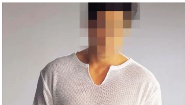
Image by Gujjar (2016), (all data has been anonymised following ethical protocol) .

Bryan Renolds 13 Grenfell Street Woodingdean Brighton BN2 8TL bryanrenolds@emailme.com https://www.facebook.com/bryanrenolds84