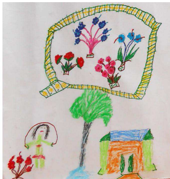
Figure 3: A child's drawing of the school ground having a fenced flower garden

Girl 4: I think so. We can learn how to grow plants and take care of plants.