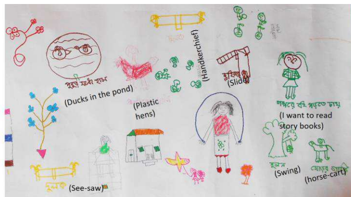
Figure 2: A drawing showing children exploring natural and manufactured play elements and engaged in solitary play or in groups

Science teacher: Children themselves can put fish and plants into water and observe how fish live in water.