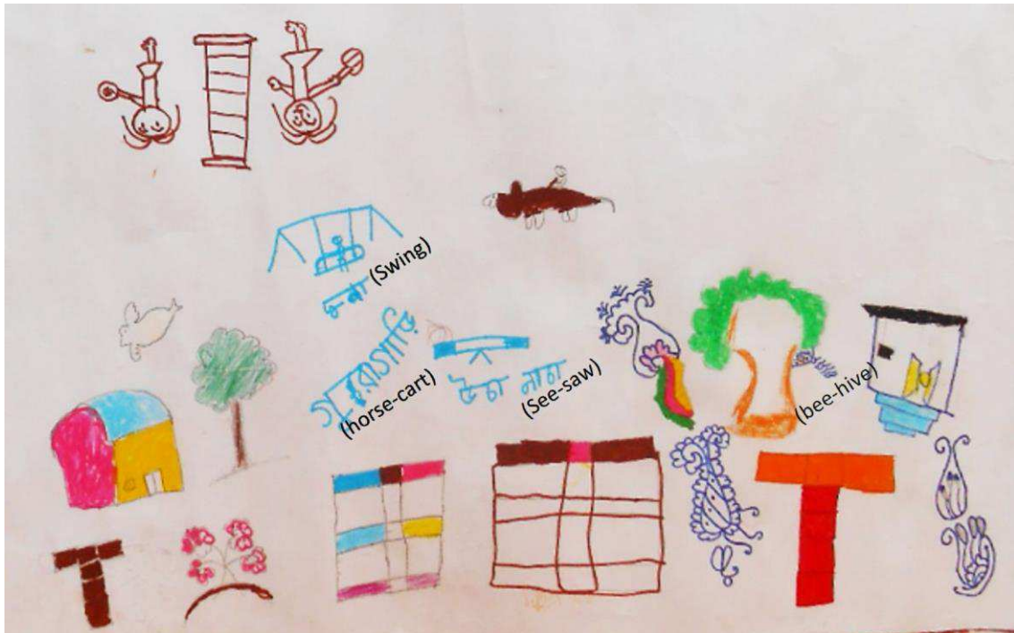
Figure 1: Children's drawing of the school ground showing interdependence of plants and animals

Further aspects of the natural environment were rivers or ponds with fish, boats and water lilies. 8% of the drawn elements were water bodies to explore and enjoy: 'I want to play with fish and ducks in the water' (Girl 2) (see Figure 2). According to the teachers, a waterbody in the schoolyard would not only be enjoyable and entertaining, but also educational. It has the potential to teach children about the flow of water and the water cycle.