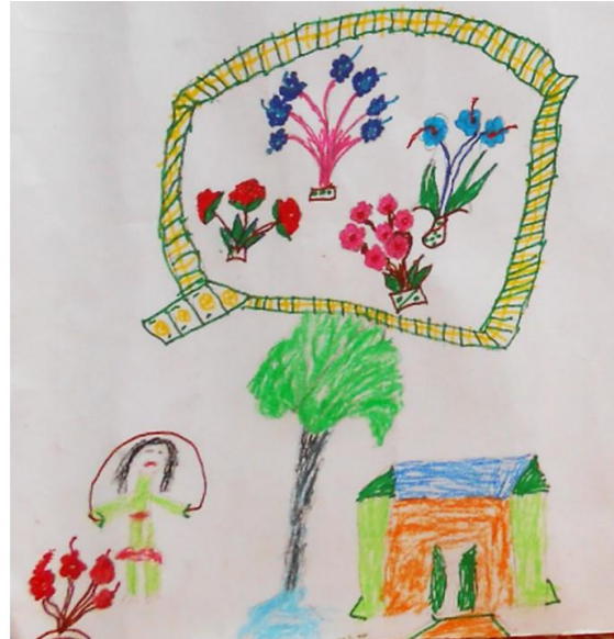
Figure 3: A child's drawing of the school ground having a fenced flower garden

Girl 4: I think so. We can learn how to grow plants and take care of plants.