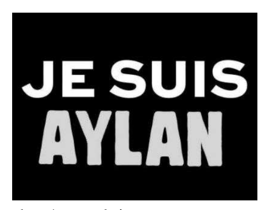
Figure 2. The meme slogan 'Je Suis Aylan' [Post No 469] 1:49pm – 3 Sep 2015 "#JeSuisAylan"

Other images pertaining to the Storyrealm include slogan memes, which are reworkings of the popular 'Je Suis Charlie' meme, as shown in Figure 2.