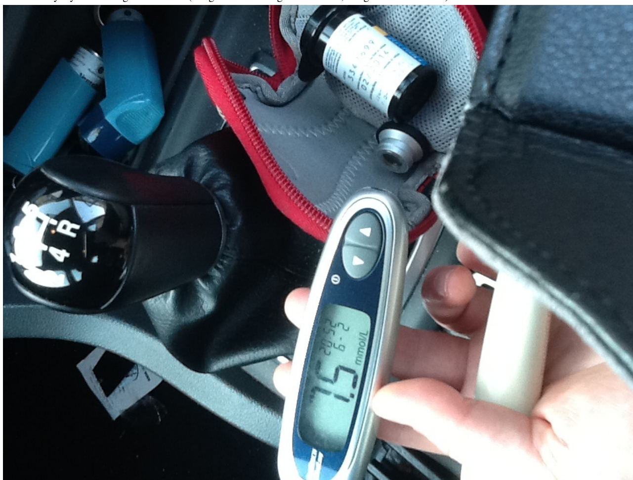
Figure 2. Everyday life and a glucose meter (image credit Aisling Ann O'Kane; image license CC-BY).

However, our work shows that complexities of everyday life such as people's work life, romantic life, friendships, hobbies, travel, holidays [27], or whom they are with [28,29] impact on the use of these devices (Figure 2). Understanding these factors is incredibly complex [30], but necessary to ensure glucose meters are reliable and meet users needs. The problem is that the evaluation methods suggested by standards are not adequate in addressing everyday use, as they have been developed with a focus on technology used in clinical environments, where there is more certainty about the characteristics of the work place and levels of training.