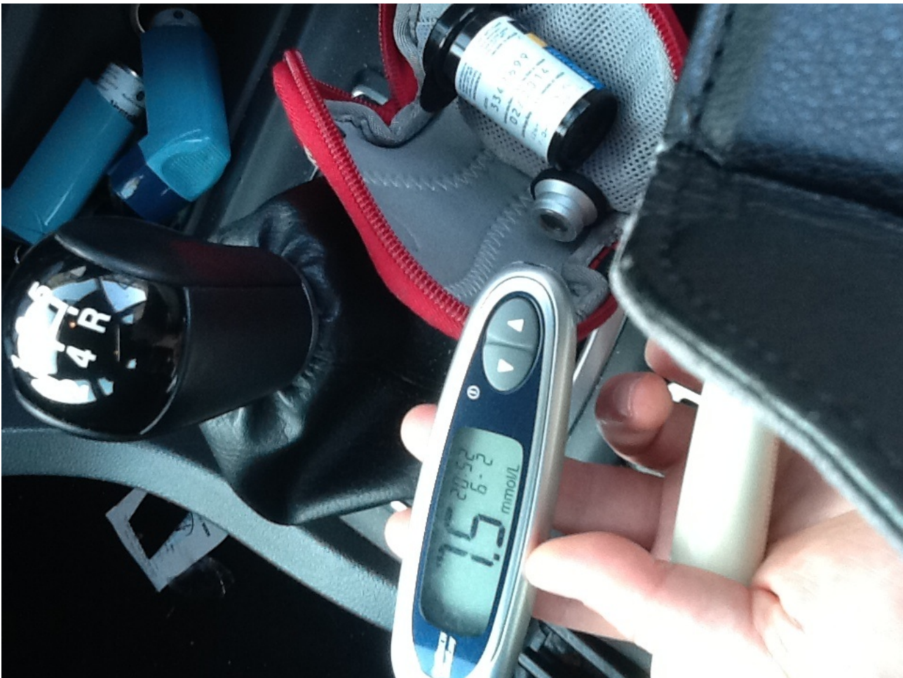
Figure 2. Everyday life and a glucose meter.

However, our work shows that complexities of everyday life such as people's work life, romantic life, friendships, hobbies, travel, holidays [27], or whom they are with [28,29] impact on the use of these devices (Figure 2). Understanding these factors is incredibly complex [30], but necessary to ensure glucose meters are reliable and meet users needs. The problem is that the evaluation methods suggested by standards are not adequate in addressing everyday use, as they have been developed with a focus on technology used in clinical environments, where there is more certainty about the characteristics of the work place and levels of training.