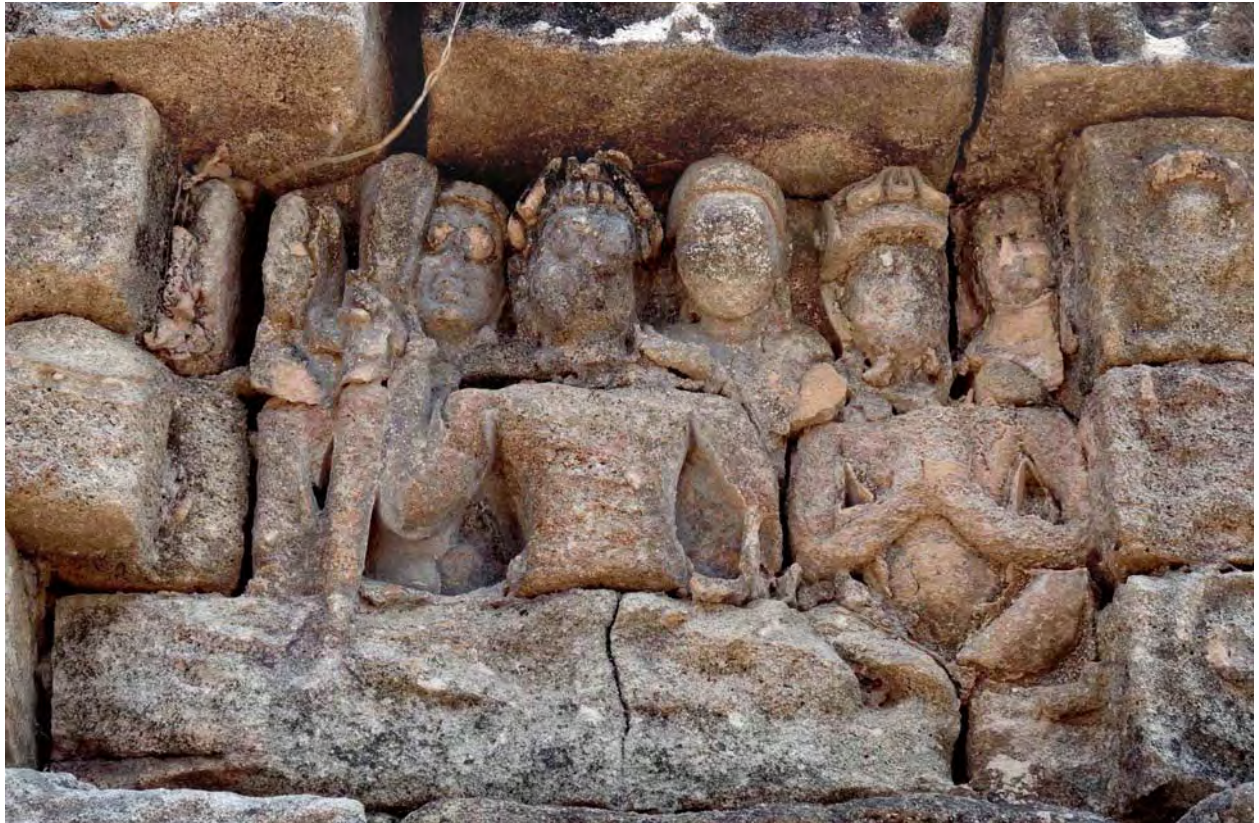
Fig. 7 above: Kothur, Śiva temple, exterior, west wall, first upper storey, Lakulīśa panel (with a sixth human head appearing on the viewer's extreme right, probably as a kind of 'witness');