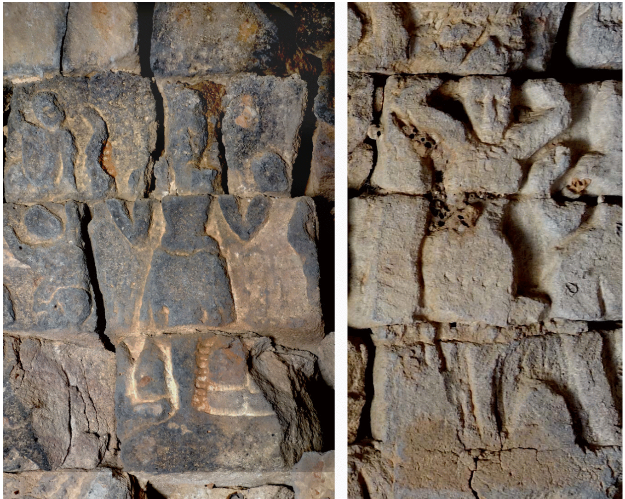
Fig. 10 a. Kothur, Śiva temple, interior, west wall, tapasvin (see also on Fig. 9, above, on the viewer's right); b. Kothur, Śiva temple, interior, south wall, tapasvinī

seen in this temple conveys originality and a creative vigour that would have been, to a great extent, drawn from a local substratum. This substratum appears to contain elements of the art of Nagarjunakonda (in particular, the crowded composition).