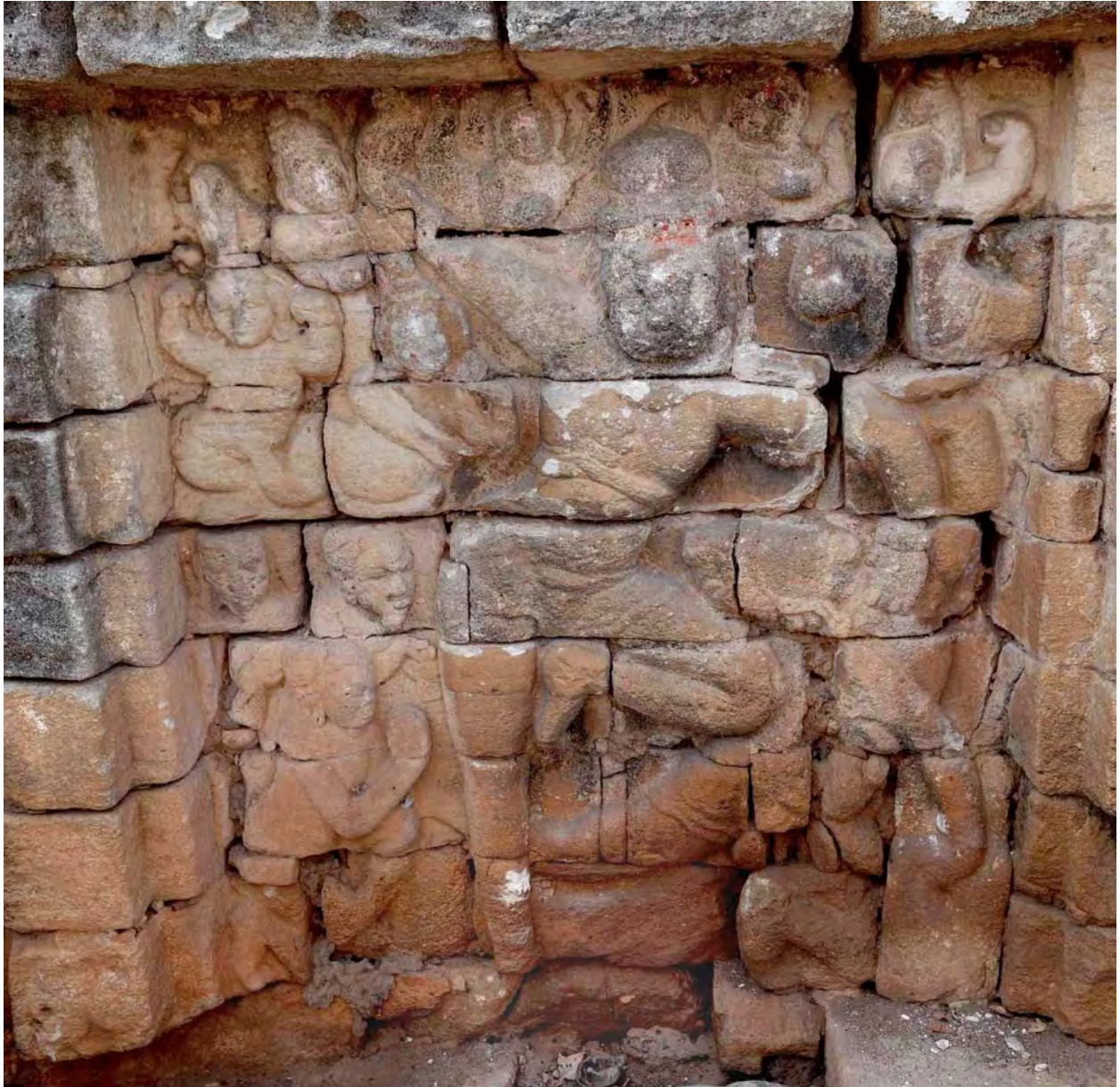
Fig. 6 Kothur, Śiva temple, exterior, north wall, bhadrā, (probable) Balarāma panel

In this hairstyle, two lateral strands are more voluminous than the rest of the hair. A similar hairdo is seen in several other female figures on this temple, its conspicuousness suggesting that certain features of 5 th -century Vākāṭaka art recur at Kothur. Another example from Mandhal can be adduced for the double-petalled lotus in Ardhanārīśvara's rear right hand. 5