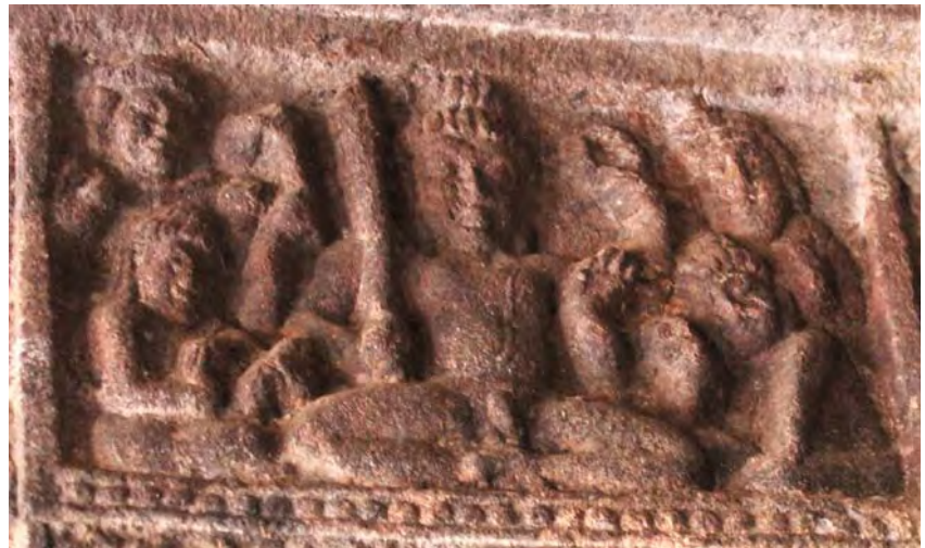
right: Badami, Cave temple 2, capital with Lakulīśa panel

prince-like figure on the viewer's right, and, most likely, Pārvatī on the left. The key to the identification seems to be another bovine head on the proper right of the central figure. His sitting posture is relaxed, and there is a dwarf kneeling below him, probably a Śivagaṇa. The standing youth appears to be touching Śiva's left foot with his right hand in a gesture of respectful salutation.