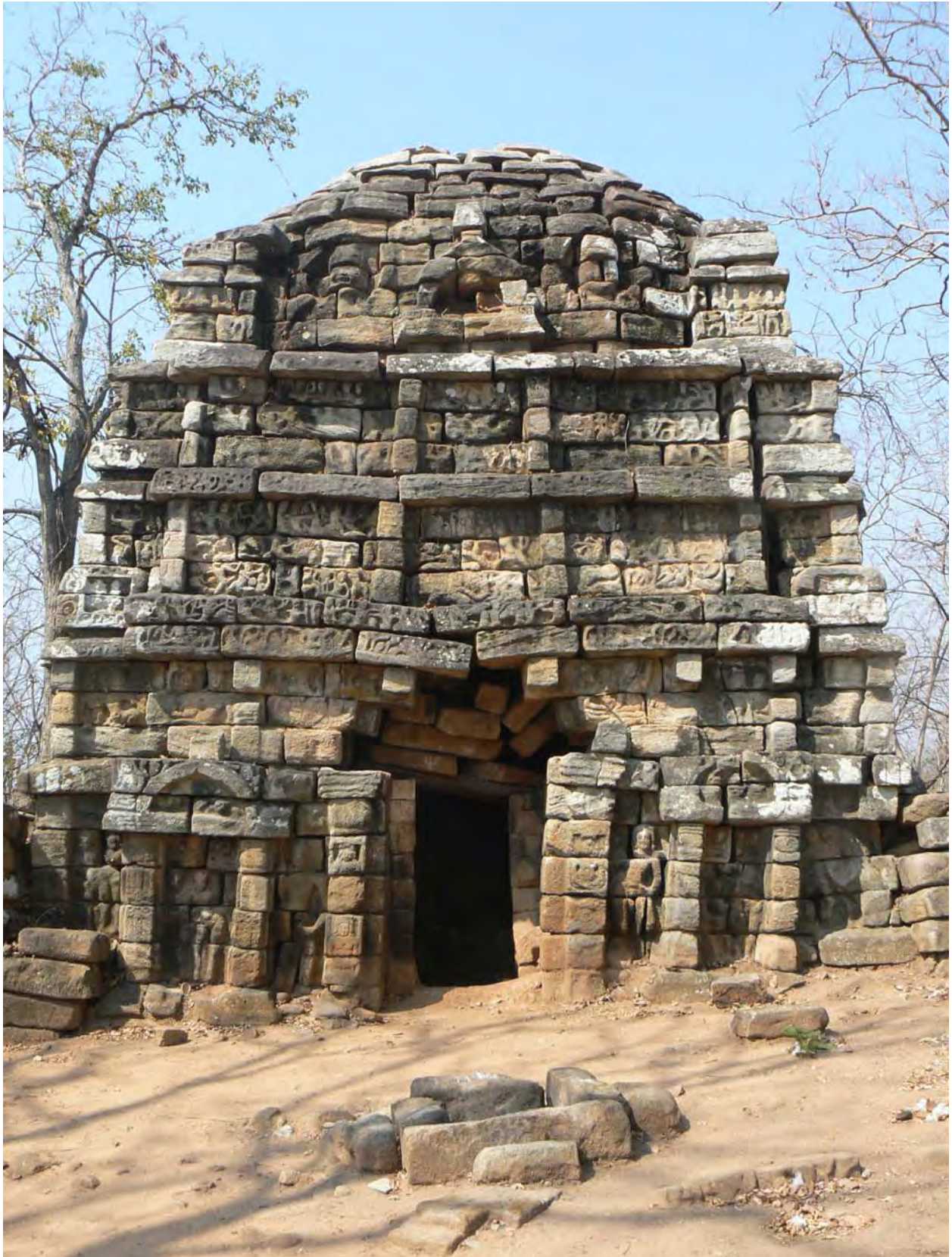
Fig. 1 Kothur, Śiva temple, eastern façade, with entrance door (lintel missing)

mouth of a hollow not far from the summit. This was surely the original tank for the temple, though locals maintain that the present earthen bund is quite recent. A natural basin in the rock outcrops close to the temple enhance this compellingly sacred setting.