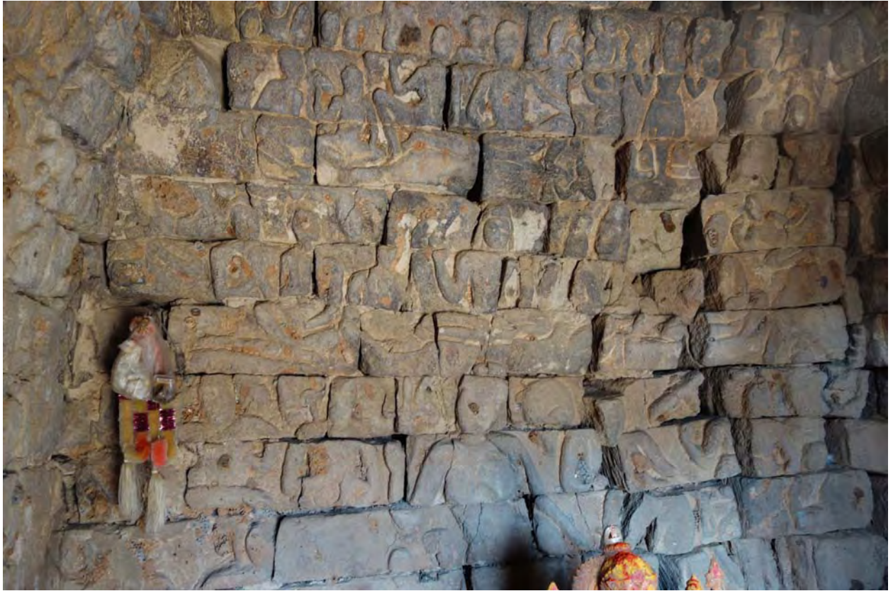
Fig. 9 Kothur, Śiva temple, interior, west wall

gesture of reassurance, and finally, Śiva and Pārvatī, apparently seated on their abode Mount Kailāsa. The south and north walls, too, are structured according to the same scheme.