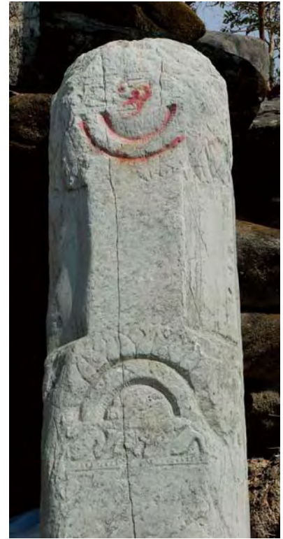
Fig. 4 Kothur, Śiva temple, limestone fragment of stūpa railing post, roughly dressed at the top (due to reuse?)

This stone temple is reminiscent of earlier timber forms with octagonal domes, rather than circular ones, notably the three-storeyed Buddhist shrine depicted in a ca. 2 nd -century relief from Ghantasala, now in the Musée Guimet, Paris. 2 The shrine at Kothur, in the elements clustered around its summit, foreshadows the fully-Drāviḍa, 7 th -century octagonal-domed temples of the Early Calukyas at Badami and Mahakuta. 3 Its mouldings, mainly rectangular and covered in reliefs, are not yet concerned with formalizing timber constructional details into sequences of shapes in stone, as seen in Calukya temples already by the early 7 th century. Indian temple architecture, while inherently representational, develops a range of abstracted and regularized elements. At Kothur, drawing on no such system, the vision of a palatial heaven profuse with divine beings is created less as an architectonic composition than as a big sculpture.