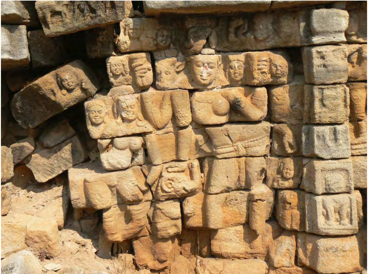
Fig. 5 Kothur, Śiva temple, exterior, west wall, bhadra, Ardhanārīśvara panel

assumes a frequently-seen posture emphasizing the female hip on the figure's proper left. However, the lower right arm is resting on what appears to be a small figure of Gaṇeśa – just one of its unique characteristics. The left frontal arm is held in a graceful dola -like position, touching down on a figure that seems to be Skanda(?) as a young child, while the rear arms hold a double-petalled lotus (right) and a square-shaped mirror (left). Another peculiar feature is the bovine head appearing on the right side of Ardhanārīśvara , close to the deity's head. This motif recurs twice on the temple, obviously, in this particular style, a marker for the vāhana of the god (cf. Fig. 8 ).