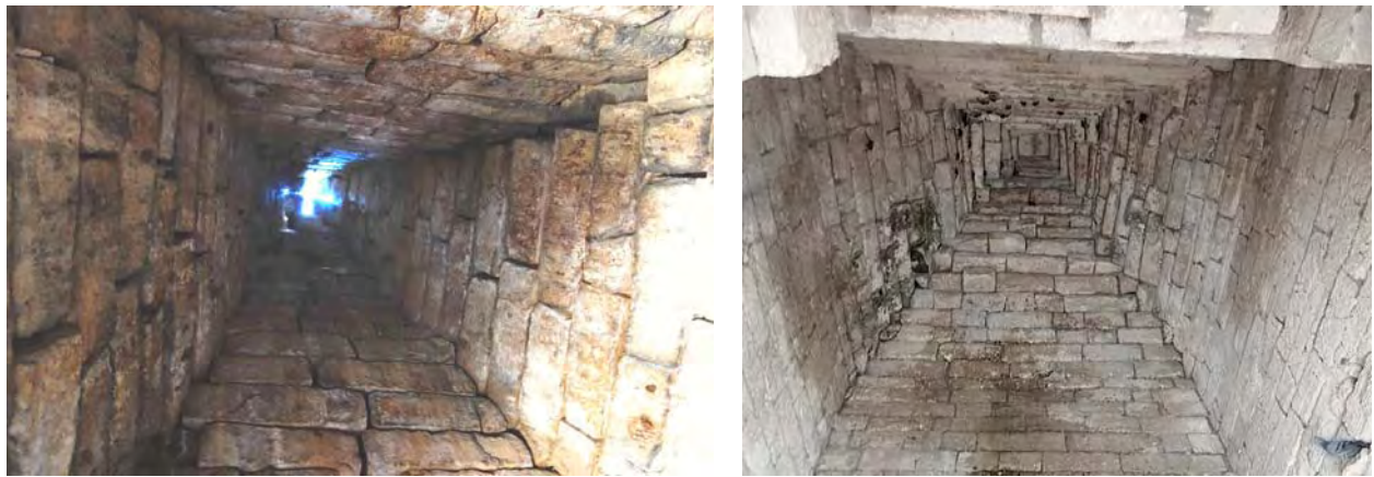
Fig. 3 left: Kothur, Śiva temple, sanctum interior, view towards the top; right: Gop, Zinawali temple, -dito.-.

and the tapering, corbelled courses are visible up to the summit, as in the ca. late-6 th century temple at Gop, Saurashtra (Jamnagar Dist.) ( Fig. 3 ). Fronting the shrine is a walled enclosure, seemingly not part of the original conception as it butts crudely against the temple surface.