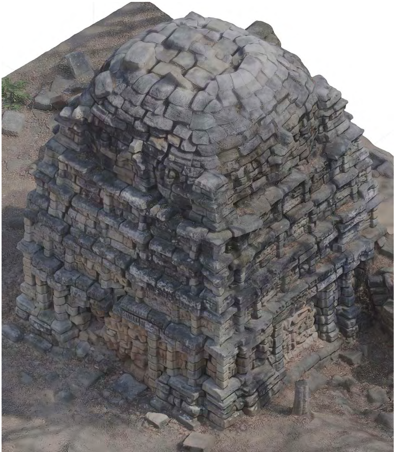
Fig. 11 Isometric view from southwest, prepared from a digital scan by Kailash Rao (24 February 2018)