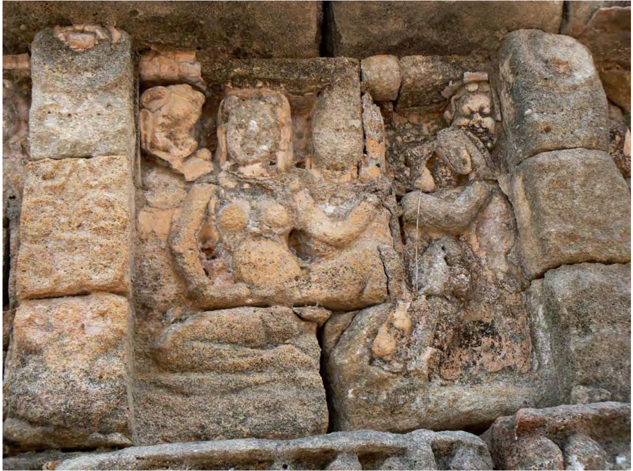
Fig. 2 Kothur, Śiva temple, exterior, north wall, first upper storey, seated Mithuna couple with patches of reddish stucco remaining in the portions best sheltered from wind and rain

The rock on which and of which the shrine is built consists of sandstone, cut into dressed blocks. These are closely fitted, and were it not for traces of mortar one would assume the masonry to be dry. Facing East, the vimāna is a stocky pile, crowned by a circular dome ( Figs. 1, 11 ). It is a little over 6 m square at the base and approaching 7 m high in its present state: the dome would have been crowned by a pot finial ( kalaśa ) or conceivably an āmalaka (with no traces of either surviving). Surrounding it are kūṭa -aedicules (miniature alpa vimānas ) at the corners, with a nāsī or gavākṣa dormer at the centre, flanked by a pair of nāsīs clinging against the circular base of the dome, as in a necklace. Each nāsī contains a large human head.