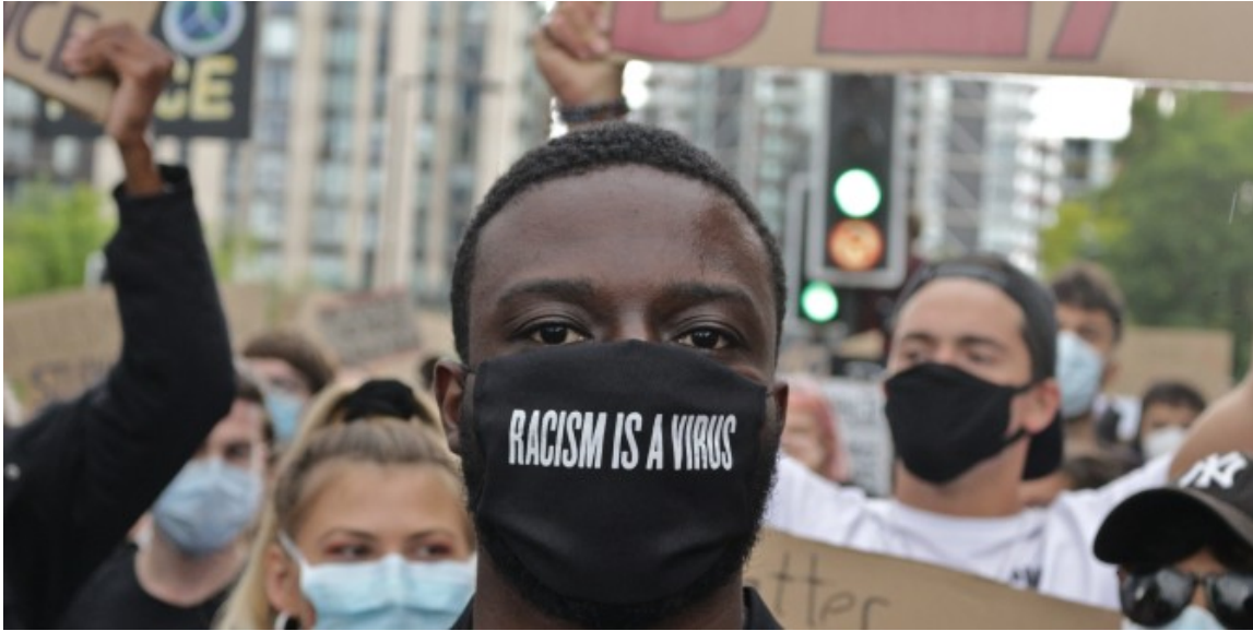
Black Lives Matter protest in London, 7 June 2020.

conspiracy theories targeting faith groups , a wide variety of disinformation has targeted ethnic minorities, religious groups and national communities.