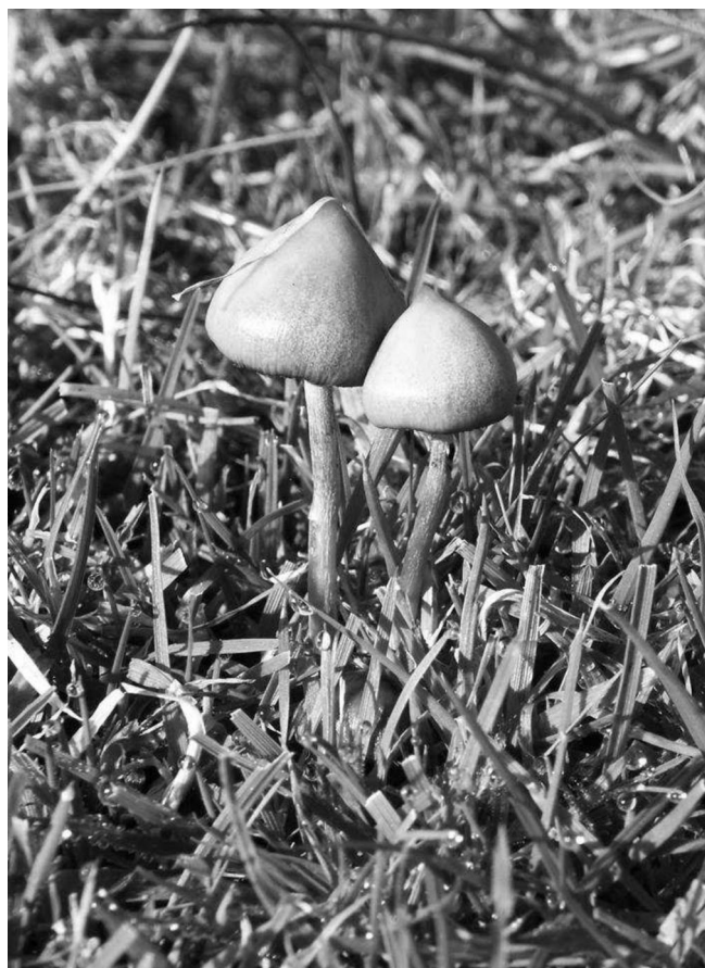
FIGURE 1 Wild Psilocybe semilanceata