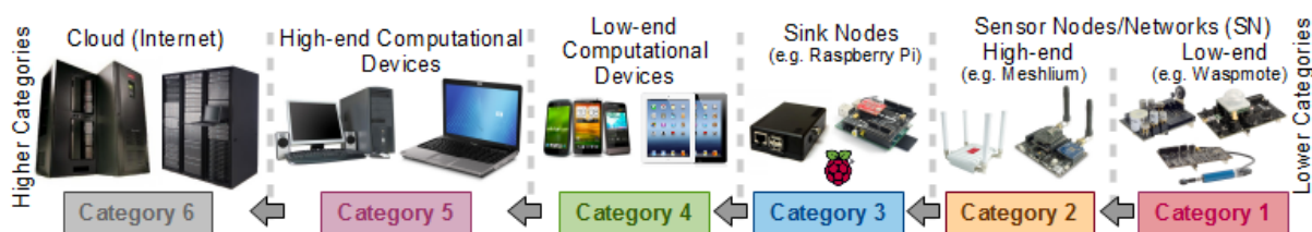
Figure 3: Categorization of IoT devices based on their computational capabilities.

In Figure 3, we illustrate a range of devices with different capabilities. We have grouped some commonly used devices in the IoT domain into a few different categories. Please note that this categorization is not done formally using any strict criteria. However, it approximates the differences between different groups in terms of the capabilities of the devices. The devices belonging to each category have different capabilities depending on processing, memory, and communication. They are also different in price where devices become more expensive towards the left of the figure. The computational capabilities also increase towards the left. Cloud computing is represented by Category 6 and rest of the categories may act as edge devices based on the context.