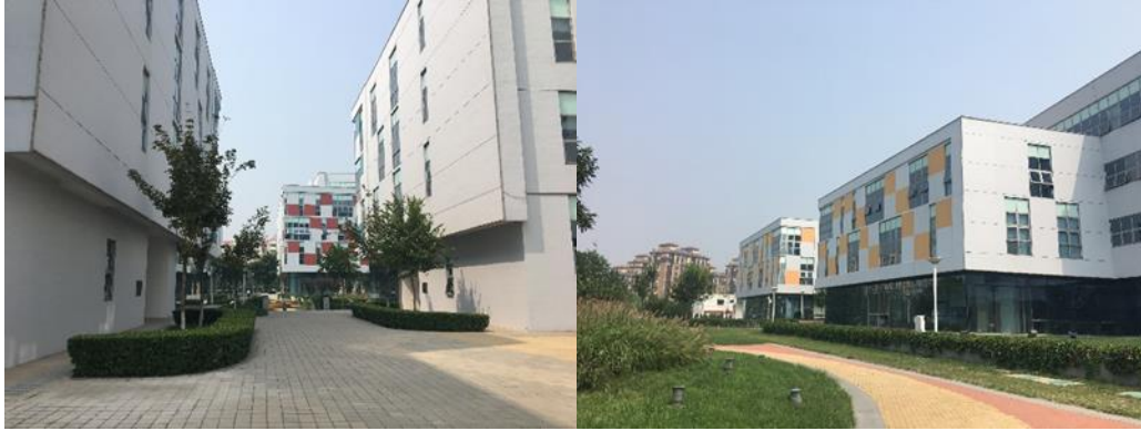
Images 1-2 SSTECH business park