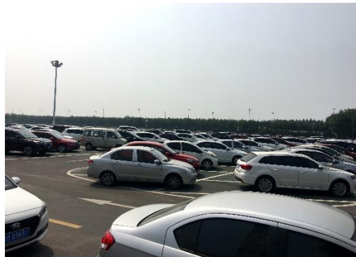
Images 5 and 6 The Fantawild Adventure amusement park and its car park