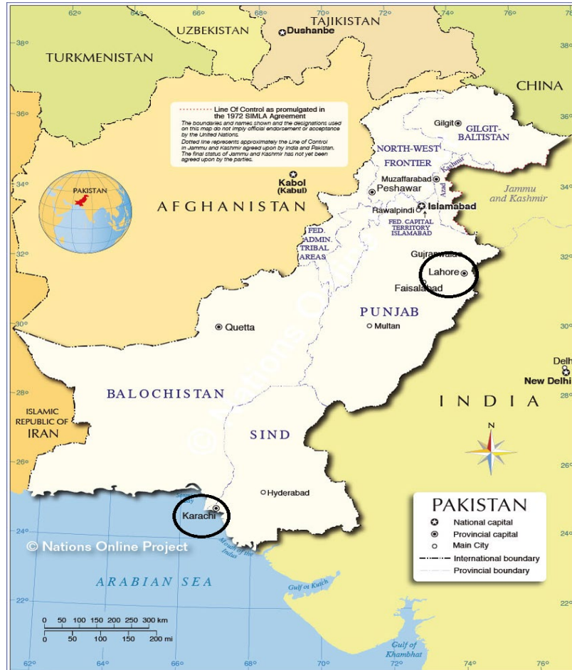
Figure 2: Administrative map of Pakistan

This chapter introduces the history, demography, culture, and organisation of the police department in the two largest cities of Pakistan. It also provides the legislative background, public perceptions of the police, major organisational challenges, and some of the innovative initiatives undertaken by the police in Pakistan. Following is a map 23 of Pakistan showing its neighbouring countries (Nations Online Project). The locations of Karachi and Lahore are encircled.