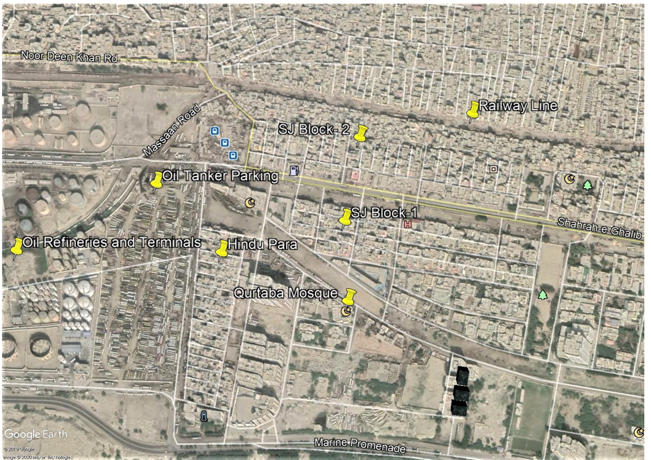
Figure 7: A satellite image where I have pinned the important places in and around SJ Colony.

My initial impression about the place was of a middle-class neighbourhood. Most houses had two or three floors; some of the houses were old while others seemed to be newly