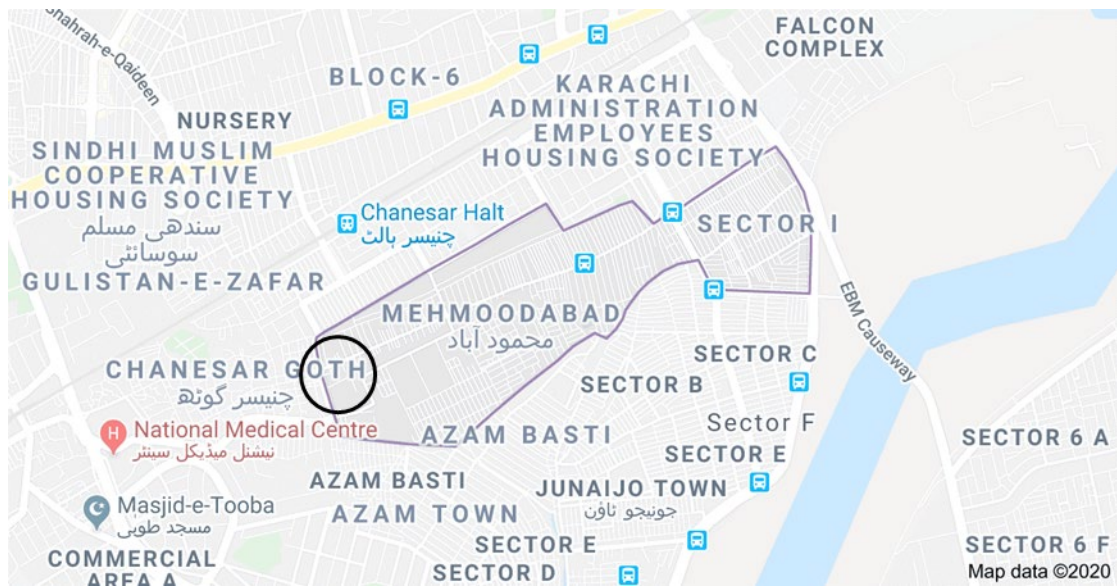
Figure 5: The circled area shows the Mehmoodabad's main T-junction and its surroundings.

Like most settlements in Karachi, the selected neighbourhood (hereinafter called Mehmoodabad) was densely populated. The average family size was six among the interviewees. There were around 12 streets in Mehmoodabad, and each street had approximately 20 to 25 houses. Most properties on sale were residential flats on the second and third floors. This was in sharp contrast to Lahore where selling individual floors of a housing unit is almost an alien concept. Due to multiple storey buildings, water and gas supply were major issues as the pipelines were not big enough to cater to this housing pattern. The sewerage system was substandard and, according to residents, even moderate rainfall caused a flood-like situation on the streets. Most housing units were 600 to 1000 square feet in size. The streets were narrow, and two cars could hardly pass in opposite directions simultaneously. Encroachment was common and building bylaws were commonly violated. Waste collection was also a frequently cited issue, and heaps of garbage could be found in and around Mehmoodabad.