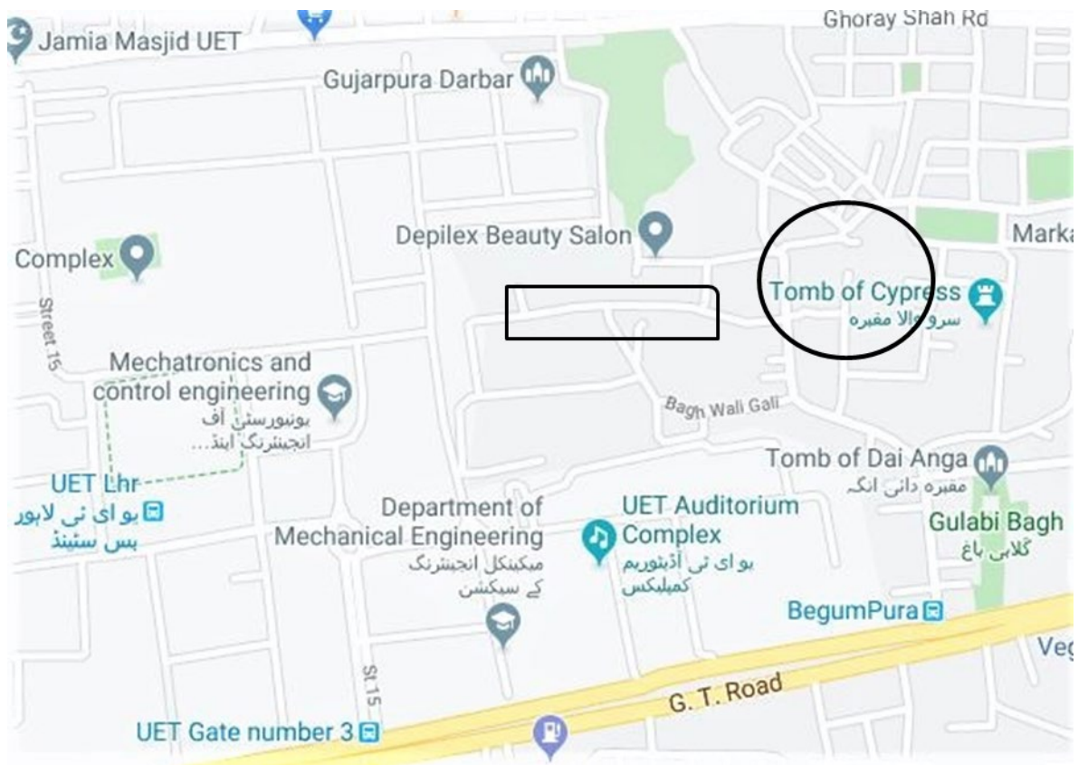
Figure 3: In this figure, the Punjabi part of Begumpura is encircled, whereas the Pathan part is shown inside the rectangle.