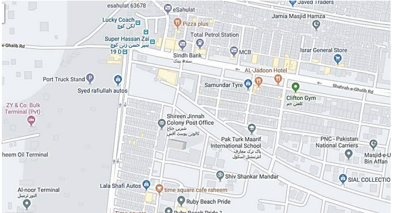
Figure 6: A roadmap which illustrates the road leading to SJ Colony and other places.