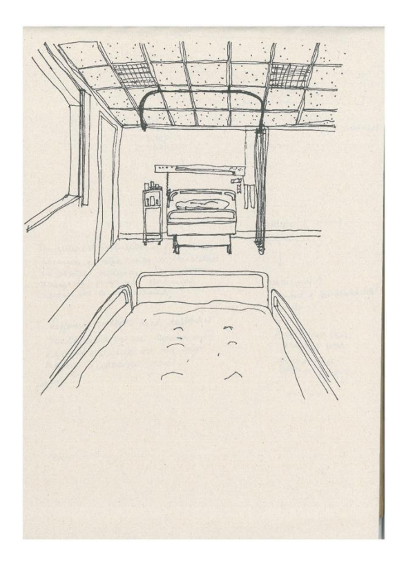
Figure 2 – Excerpt from diary exploring the memories of the hospice: I tried to imagine what it must be like, in her fleeting moments of lucidity and consciousness to see this world around her. Her bed faced the bed directly opposite, her view being either another dying person and their loved ones or the standard blue pleated disposable curtains that divide up the rooms. Why blue I thought to myself, in all other settings blue feels safe and serene, a calming colour - yet here without any other offer of warmth it felt austere and barren. They weren't pulled across at that moment, but I could trace them and follow them around the room, their metal tracks hanging low from the gridded ceiling panels pockmarked with holes. The ceiling was her last tableau.

In order to record their time as a daughter within the in-patient hospice - the 'insider' position - of the doctoral research is being explored through visual and written multi-sensory vignettes. The visual modes include free-hand sketches, orthographic and technical drawings, and models made from memory as a means to narrating what Ken Plummer describes as the act of "recollecting, re-membering, re-discovering"<sup>12</sup> their memories of the