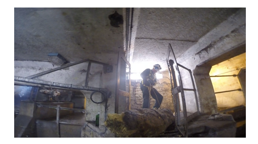
Figure 2. Repetitive, mundane, yet vital maintenance: pulling a log out of the River Frome (underneath Bristol City Centre).

Maintaining flow is, of course, critical to the management of urban sewage systems. In order to better understand the process, we spent a day (23 February 2016) at the Avonmouth waste-water treatment facility (run by Wessex Water) on the outskirts of Bristol. It is now well-documented how the build-up of cooking oils and fat in combination with non-decomposable items such as wet wipes likewise poses major challenges for the flow of wastewater.<sup>63</sup> Reflecting on (and lamenting) increased use of disposable wipes (particularly those sold as 'flushable'), a Wessex Water manager.<sup>64</sup> noted: '. . . the nation's culture is changing. We are affecting an asset base that is very old, weakening, vital, but "out of sight, out of mind" . . . but this problem is making it worse'. This comment both echoes the disposition of care towards infrastructure on the part of maintenance workers noted in the literature, as well as a tacit indictment of a citizenry that is insufficiently caring towards the