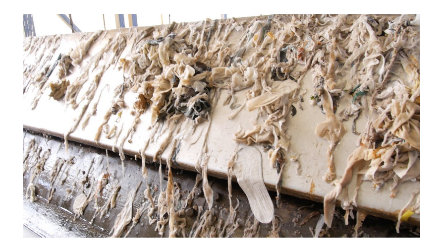
Figure 4. Accumulation: materials that have not degraded or decomposed in the sewers. These will be composted and eventually used for land reclamation.

In a further example, during high tide events of the river Avon, (non-potable) water enters a distribution tunnel underneath the river that contains a 27" water main (a pipe that delivers drinking water to much of Bristol). When this occurs, a pump automatically engages and shifts river water out of the tunnel and back to the river (see Figure 4). As one of Bristol Water's operatives explained 'we need to keep it [the tunnel] dry, we don't want contamination from river water'.<sup>76</sup> In-between periodic (and, in truth, infrequent) bouts of mending or replacement, this device keeps the city's water supply safe without human interference for years at time. We suggest that these examples show some of the ways 'things' actively participate in assemblages of care and, building