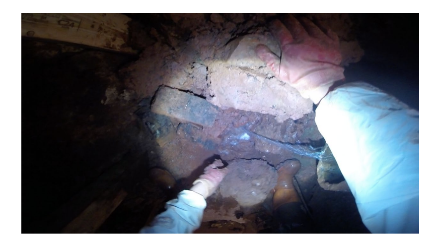
Figure 1. Invisible yet proximate: a miner clearing earth at a broken sewer underneath a street in Clifton, Bristol. Notice the waste water flowing into the tunnel from the pipe on the right.

our field visits. Thus, at any given time in Bristol (as in many places) mending occurs 'alongside' showering and bathing, largely unseen yet proximate in distance, and sometimes even 'right beneath our feet'.