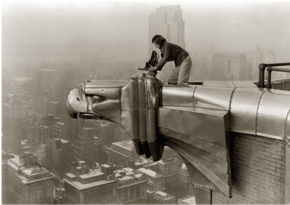
Fig. 7 Oscar Grauber, Margaret Bourke-White on the Chrysler Building, Manhattan, 1935.

ploration. But when Candace goes to the mouth of the flooded subway station, "pushing aside the caution tape" and taking pictures at the sucking lip of the black water, it brought to my mind a different context for understanding her photography. 32 Forcing her way down the steps, Candace makes the opposite journey to Margaret Bourke-White, who, in the late 1920s and 1930s, scaled the heights of the growing city with her camera.