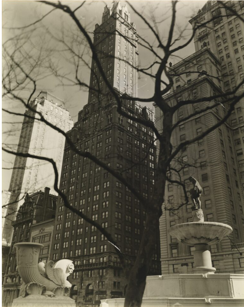
Fig. 8 Berenice Abbott, Central Park Plaza: Hotel Sherry-Netherland (center), Hotel Savoy Plaza (right), from 58th Street and Fifth Avenue, Manhattan, 1937.