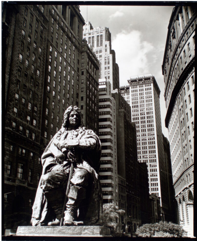
Fig. 10 Berenice Abbott, De Peyster Statue, Bowling Green, looking north on Broadway, Manhattan, 1936. The Miriam and Ira D. Wallach Division of Art, Prints and Photographs: Photography Collection, The New York Public Library .

Abbott's photography sets the terms of the visual language of the pandemic, in our world and in the world of Severance . With Changing New York , Abbott recorded the city at another moment of crisis, during the Great Depression — which was also a moment of stasis, as building and demolition projects ground to a halt. Hers was a city, like Candace's, suspended between past and future; and she makes a similar critique of its expansionist (and consumer capitalist) imperatives. The first image in the book version of Changing New York (1939) features a Bowling Green statue of Abraham de Peyster, a prominent political figure in Dutch colonial days (Fig. 10). By opening the book in this way, as John Raeburn notes, Abbott invites us to contemplate the city "as an outpost of imperial colonizing and to contrast what it had been at the end of the seventeenth century with what it had since become — the leading city of a major world power, symbolized by the solidity and mass of those buildings of the financial district that surrounded the statue." 35 Eschewing the city's tourist attractions and undermining romantic and ahistorical conceptions of the city, Abbott's book reflects ambivalence about New York's function in the modern world order.