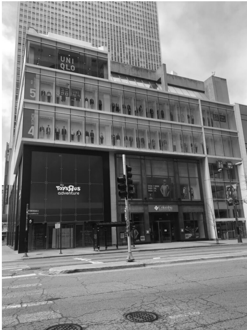
Fig. 12 Ling Ma, Chicago, 2020.

Ma photographs the area where she once worked as a fact-checker at Playboy magazine — which is also where she first conceived of Severance . As she explains in the article,