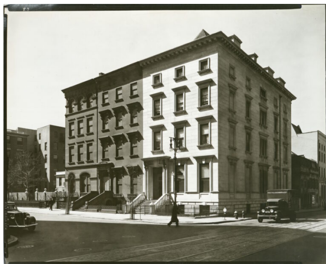
Fig. 9 Berenice Abbott, Fifth Avenue, Nos. 4, 6, 8, Manhattan, 1936.