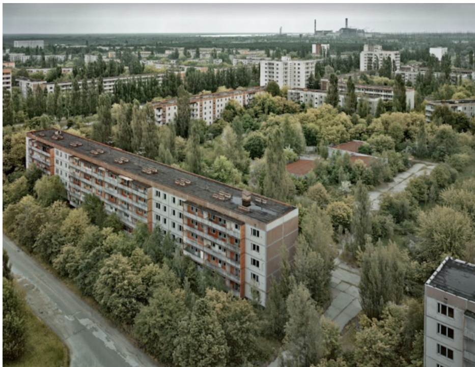
Fig. 5 Robert Polidori, View over Chernobyl, 2001. From the series Zones of Exclusion: Pripyat and Chernobyl.

Ruins photography is often accused of fetishizing urban decay and producing nostalgia for industrial development. 23 When some of the readers of Candace's blog call her work "disaster porn," they criticize her in just this way. 24 But it's in New York's creeping decrepitude, not in spite of it, that the city becomes Candace's own — made in her image, made for ghosts. At a basic level, anything other than landscape photography is precluded by the evacuation of the city's inhabitants, yet Candace's turn to landscape is actually a return, not only to her 2006 posts but also to her college honors project, a series documenting old steel towns in the Rust Belt. The project, intended as the first of several on America's declining industries, never eventuated because of Candace's mother's illness and death. Candace's documentation of post-pandemic New York is the next installment of that formative project — and it celebrates rather than laments the city's "haunted look." 25