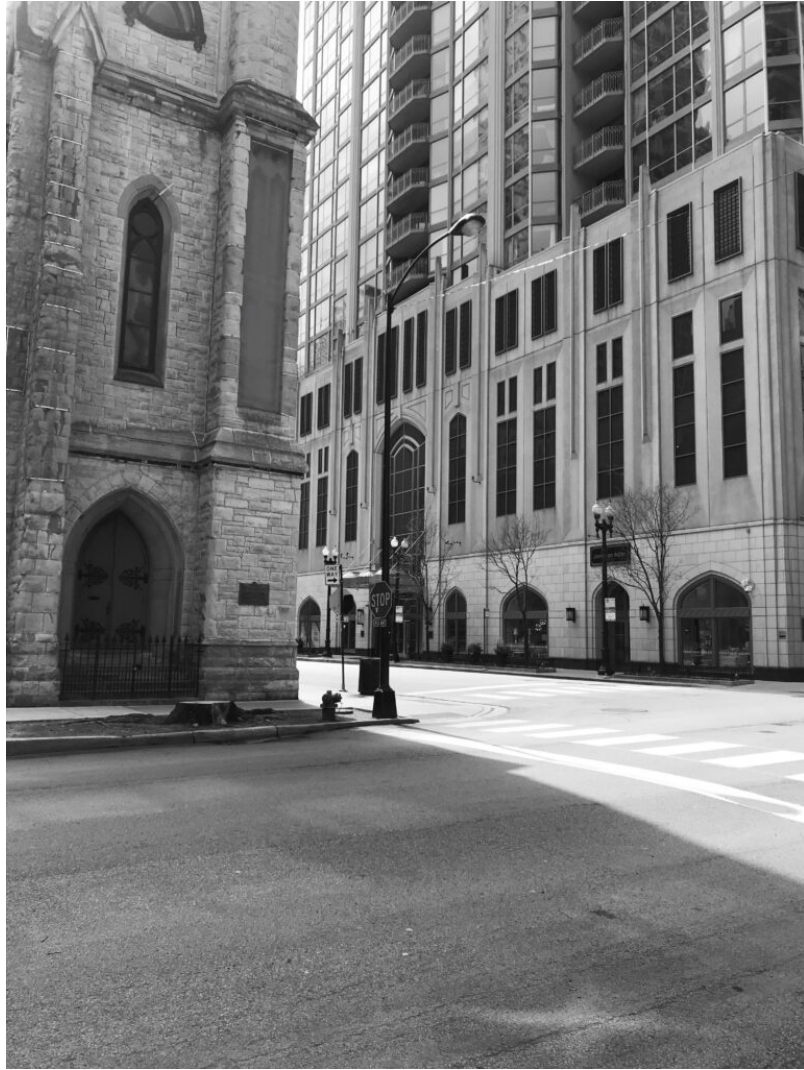
Fig. 11 Ling Ma, Chicago, 2020.