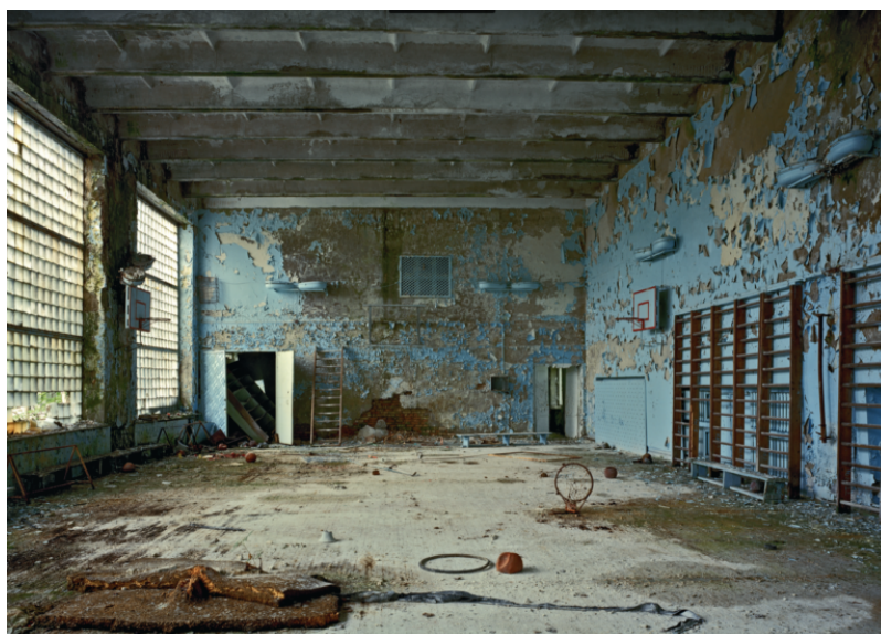
Fig. 3 Robert Polidori, Gymnasium, Pripyat, 2001. From the series Zones of Exclusion: Pripyat and Chernobyl .

The pandemic phase of Candace's blog is a bid for human contact in the form of human absence; it marks an attempt at communion even as it concretizes its loss. The decaying, empty city reminds Candace of "the Robert Polidori photographs of Chernobyl and Pripyat, a ghost town that formerly housed the nuclear-plant workers. Or the Yves Marchand and Romain Meffre images of Detroit, the images of abandoned auto plants and once-grand theaters. And the Seph Lawless images of the vacant, decrepit shopping malls that closed after the 2008 crash." 22 Her new photographs, then, take after ruins or urban decay photography (see Figs. 3-6).