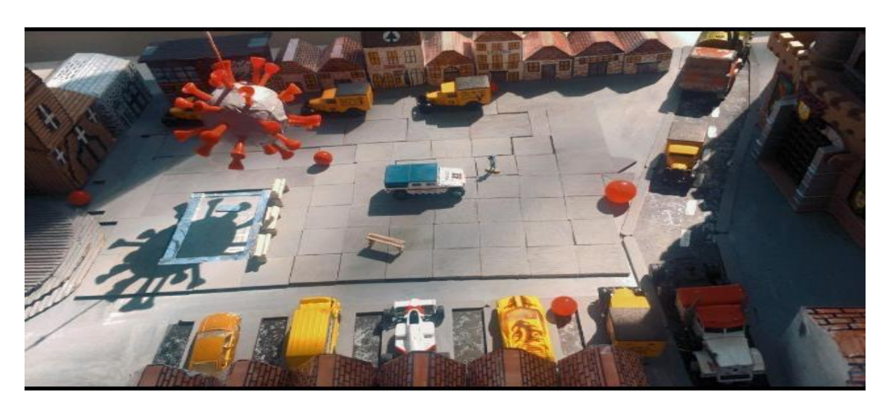
Figure 1: A young person's representation of COVID-19 in their locality

One young person created a piece of artwork (Figure 1), depicting his deserted town and discussed anxieties as the virus loomed over his home: