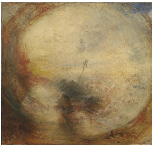
J.M.W. Turner, Light and Colour (Goethe's Theory) - the Morning After the Deluge - Moses Writing the Book of Genesis