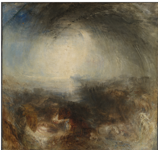
J.M.W. Turner, Shade and Darkness - the Evening of the Deluge