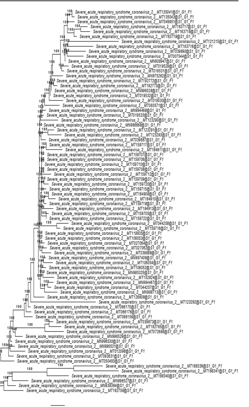
Fig. 3 Phylogenomic tree inferred using the formula D6 (GBDP_Trimming_D6_ FASTME). The numbers above branches are bootstrap support values from 100 replications