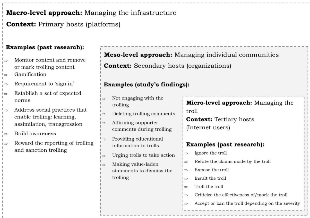
Figure 1. Current perspectives on trolling management

Other disciplines have begun to generate preliminary insight into the organizational practice on managing various online misbehaviors (e.g., cyber-bullying, incivility, consumer conflicts) (Dineva et al. , 2017; Langos, 2012). However, as outlined earlier, trolling represents a unique deviant behavior and thus requires different management techniques to those used when moderating other deviant online behaviors.