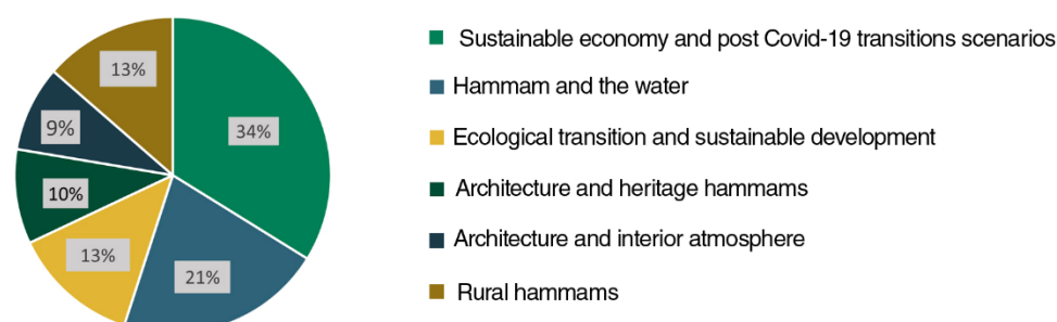
Figure 4. Pie-chart with percentages of numbers of participants in each of the six virtual Eco-hammam forums in which a total of 331 stakeholders were directly engaged.

The importance of financial aspects was also pointed out by different participants during the opening event, who highlighted the risks associated with the economic stress imposed by COVID-19-related restrictions on the hammam sector. Concerns were raised about the sector being “neglected, failing to attract the attention of the authorities concerned, despite its social, economic, health and cultural importance”.