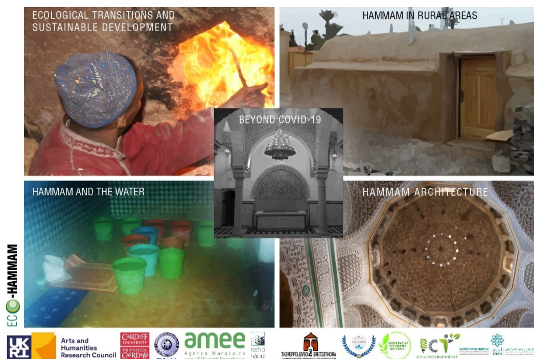
Figure 3. Sample of posters from Eco-hammam virtual forums.

of responsible energy and water production and consumption, and improved indoor conditions for hammam workers and users' health, safety and well-being (Figure 3).