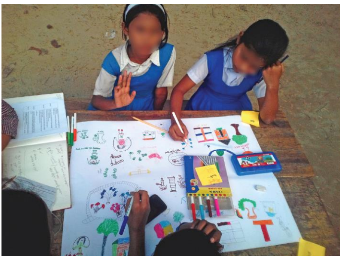
Figure 9.4 Combined drawing exercise as part of focus group discussion at the study school in Bangladesh

In our study, we found the combination of focus groups with drawings to be very useful. At the end of each focus group the children were asked, when still in groups of five or six, to make a combined drawing, on a 50x75cm sheet of paper, of their school ground as they wanted it to be, including different elements they would like to see and activities they would like to do either with their peers or alone (Figure 9.4). While drawing, the children interacted with each other, discussed what they wanted and also conveyed their desires to us. After they had finished, the children were asked to explain their drawings of their dream school ground. They were also asked whether any of the elements they wanted in the school ground had any implications for what they learnt from their textbooks or were taught in classrooms. There might be debate on whether children can provide useful information or to what extent they can contribute to the design of a play for pedagogy; however, we found the children's contributions useful (for more information on the detail of co-design and development of the school ground see Khan et al, 2020 ). We found the combination of focus group discussion and drawings useful, as they did not leave any scope for ambiguity in their interpretation, since they themselves explained them during the discussion.