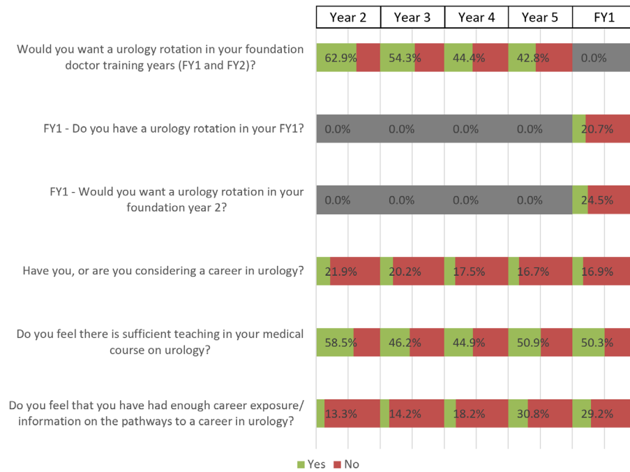
Fig. 3 Postgraduate career and exposure, stratified by year group. Percentage (%) corresponds to the 'Yes' value.

17.3% of all Year 2 to Year 5 medical students and FY1 doctors collectively (7063/40 927). In addition, representation was achieved across all 39 eligible UK medical schools. This enabled us to capture the heterogeneity in placement exposure, both across and within UK medical schools. To our knowledge, this is the largest study on specialty-specific undergraduate teaching. We did not find any comparable large-scale evidence on urology education during medical school in other countries. This makes the LEARN the only study worldwide to investigate this and serves as a good baseline for other countries to investigate their undergraduate urology exposure. Additionally, there was no strong evidence to suggest significant variation in results between medical schools based on the number of responses (Fig. S18). Medical schools with a greater number of responses tended to fall within a reasonable difference to the national average, whilst medical schools with a lower number of responses were at risk of over-estimating urological exposure.